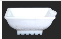
3. Mustard Jar Lid Creamer Type