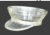
4. Officer's Cap