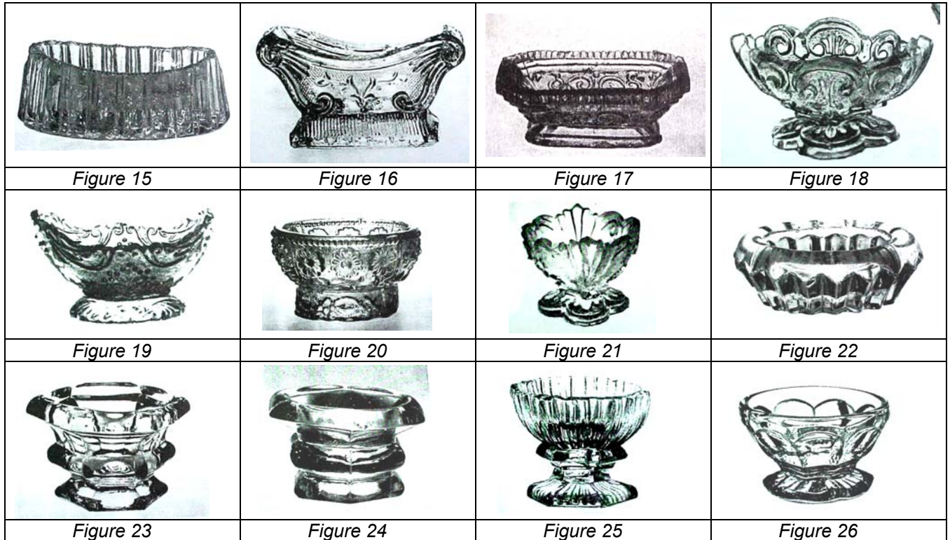
Figure 15 is our salt, the 1853 Holmegaard one.

Figure 16 is a lacy staghorn type, very close to the Sandwich SN type in Neal.