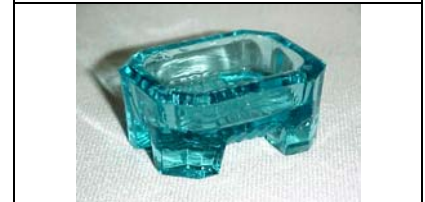
Figure 10 2" long