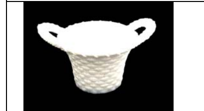
Figure 13 2-1/4" high