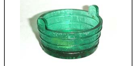
Figure 9 3" diam.