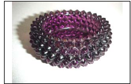
Figure 6 3" diam.

One shape we never considered for our collection is the Shell Salt Dip shown at the right (Figure 11). It looks like an ash tray, but that's not what Kemple called it. This is another shape we need to look for when we're browsing through the shops and flea markets. Once we identify something that the maker called a salt, it becomes a desirable item for our collection, even if it looks like it could have other uses.