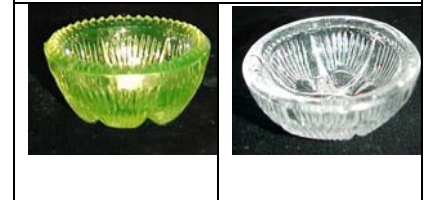
Figure 7 2" diam.