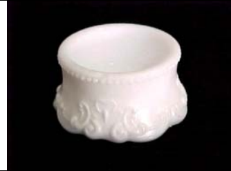
Figure 2 3” diam.