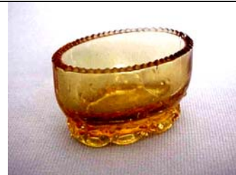
Figure 1 2-1/4” long

The third salt listed but not illustrated is the DIAMOND pattern. The book shows a drawing of an Iced Tea Pitcher, but none of the salts in our collection match it. Notice that the diamonds have a square base. We have a salt where the diamonds are taller than they are wide, but none with a pattern like the pitcher. We would expect the salt to be in milk glass or in color – another one for the “must find it someday” list.