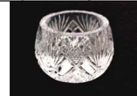
Figure 4 1-3/4” diam.