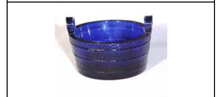
Figure 8 2" diam.