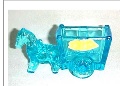
Figure 14 4-3/4" long

Since Kemple used old molds, the shapes he reissued are just like those from the original factory.. Fortunately there weren't very many, so he had little impact on open salt collecting.. Now that his firm is out of business and the molds are in the hands of Wheaton Industries, we don't think the picture will be changed any further.. We will never be sure who made our colored YUTEC salts, our colored wooden tubs are probably younger than we are, and the OCTAGON situation is as confusing as ever. Like salts from Joe St. Clair, the Kemple ones will at least retain their current value in the foreseeable future.