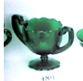
Figure 3 – Sugar Bowl