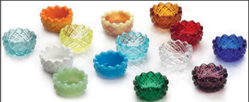
From 2011 Mosser catalog

Note: Connection between Cooper- ative, Westmoreland and Federal unknown. Westmoreland catalog of 1917 shows that their No. 555 line has no other item that have any fans in the top row. See RO-UT-2-9.