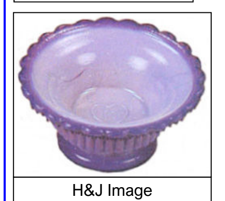
3-3/16" D x 1-1/2" H

Degenhart Glass 1952-1972 Unmarked 1972-1978 Marked D in a Heart