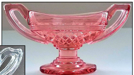
STRATFORD pattern with flat top