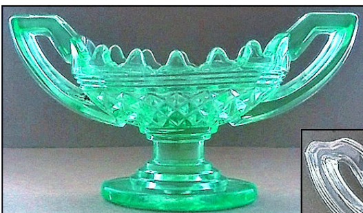
STRATFORD pattern with tooth top