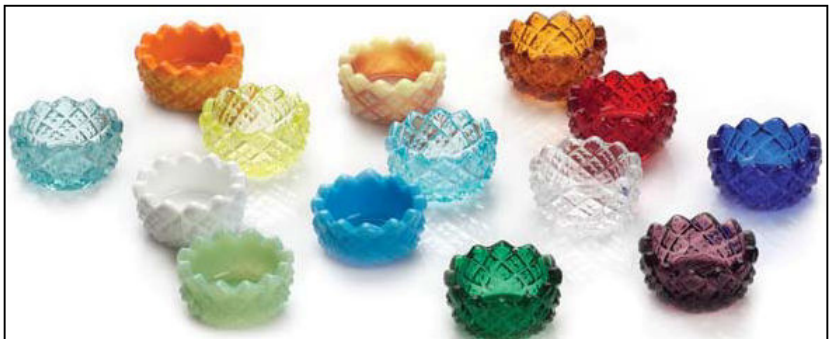
From 2011 Mosser catalog

Note: Connection between Cooperative, westmoreland and Federal unknown. Westmoreland catalog of 1917 shows that their No. 555 line has no other item that have any fans in the top row. See H&J 399 and 2682.