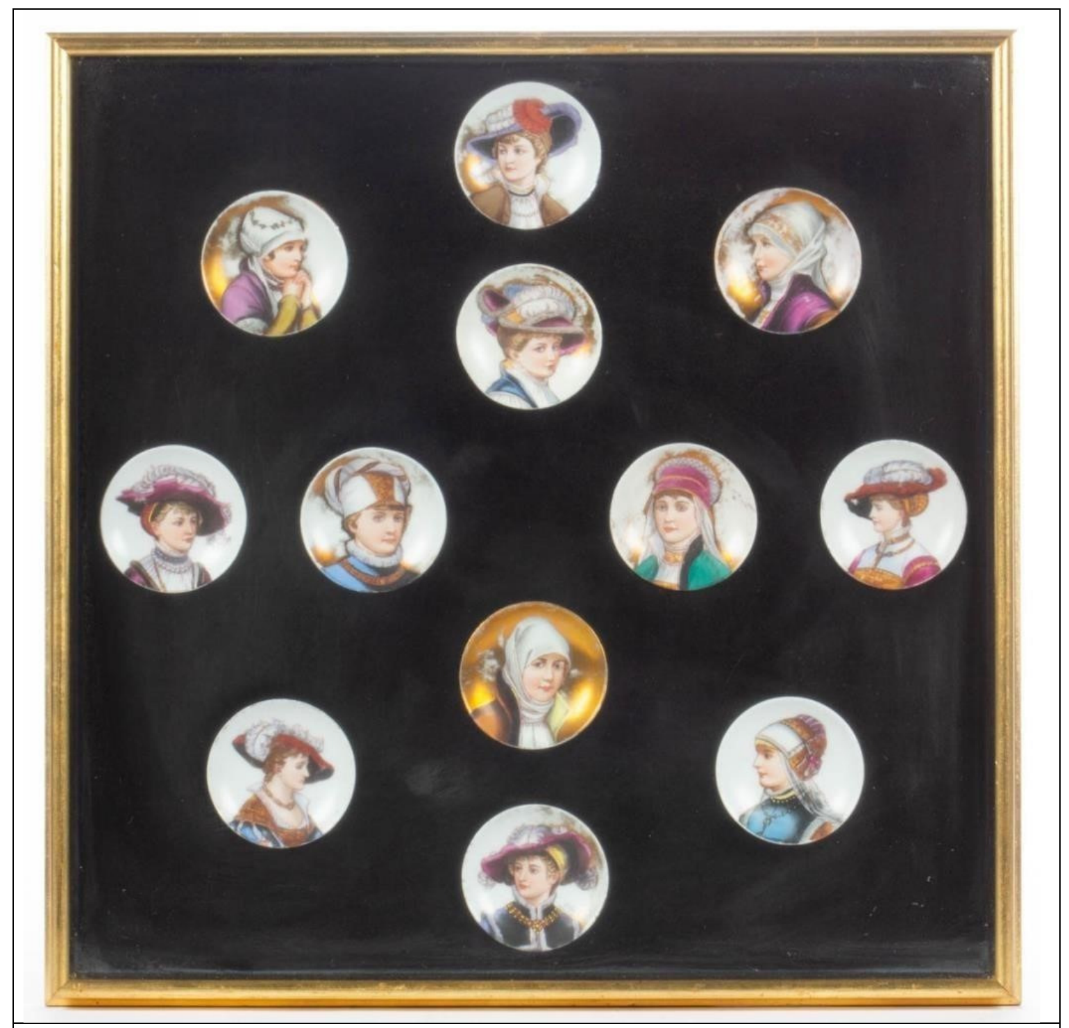
Lot 1549 CONTINENTAL HAND-PAINTED PORCELAIN FRAMED OPEN SALT / BUTTER PATS

comprising a collection of 12 approximately 2 3/4" D circular pats, each featuring polychrome portrait of a well-dressed woman and professionally mounted in a square gilt-painted frame. Late 19th century. 17 3/4" x 17 3/4". Undamaged, frame with some minor wear to gilt decoration. Pats not examined out of frame.