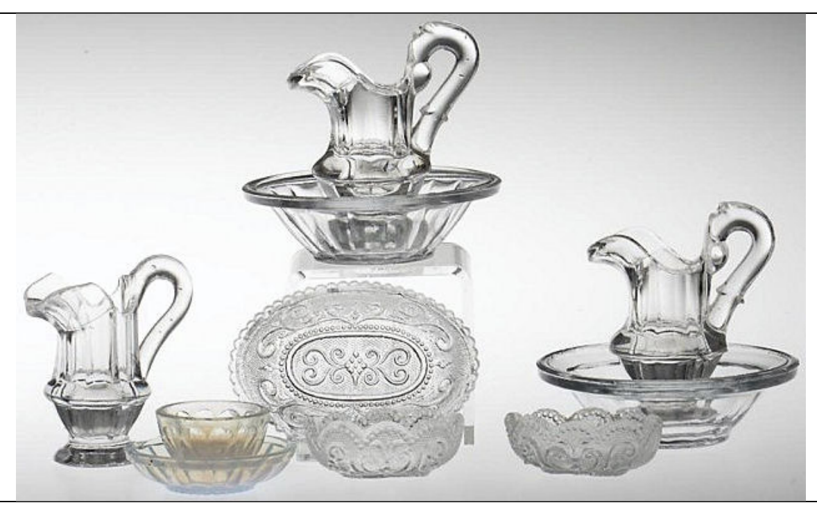
Lot 289 - ASSORTED PRESSED TOYS, LOT OF 10 PIECES,

comprised of an opalescent Paneled handless cup and saucer, along with two colorless Paneled pitchers and basins, one additional pitcher, and three lacy articles. Boston & Sandwich Glass Co. and others. 1835-1870. Various sizes. Opalescent saucer with a wide chip to rim, oval lacy dish with a rim chip, remainder proof to near proof.