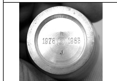
1983 Salt Mark