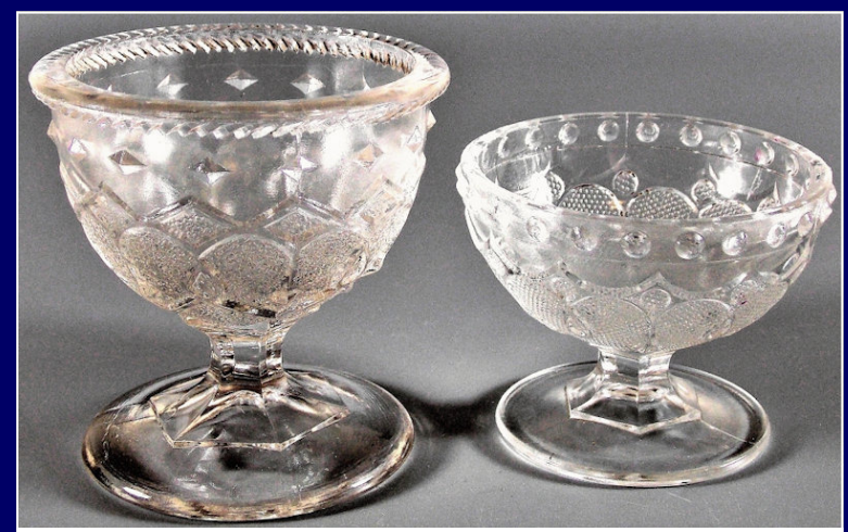
Loop and Dart with Diamonds