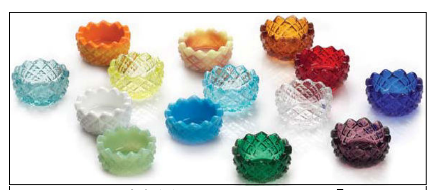
From 2011 Mosser catalog

Note: Connection between Cooperative, Westmoreland and Federal unknown. Westmoreland catalog of 1917 shows that their No. 555 line has no other item that have any fans in the top row. See RO-UT-2-9.