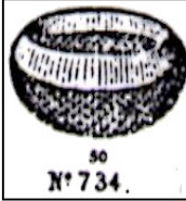
so N° 734.

KASTRUP NO. 734 Kastrup Glassworks (Denmark) c.1886