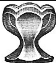
No. 65 Footed Individual Salt