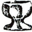
No. T787 Individual Salt