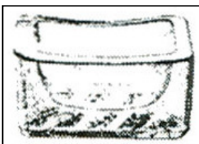
Individual Salt No 900.