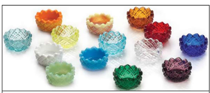
From 2011 Mosser catalog

Note: Connection between Cooperative, Westmoreland and Federal unknown. Westmoreland catalog of 1917 shows that their No. 555 line has no other item that have any fans in the top row. See H&J 399 and 2682.