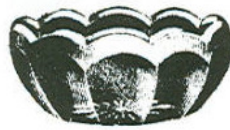
No. 205-- Individual Salt