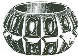
No. 12—Individual Salt