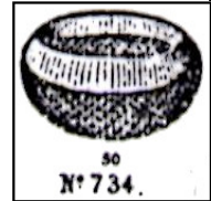
50 N° 734

Note: Also comes in mid and table sizes. It appears from catalog drawings the Bryce salt has partial diamonds above the center line and Central does not. There are also 2 versions with a collar base, one by Baccarat. See H&J 372.