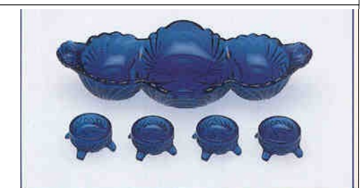
Set No. 7