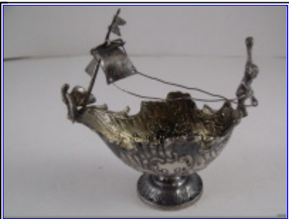
Hanau 800 ship - I love this one to the seven seas and back -

61 Mary 07-21-2018 09:37 AM ET (US) IP: 72.220.215.254