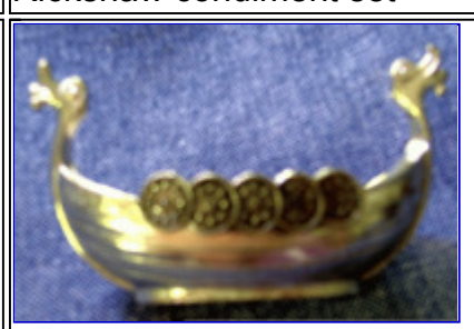
Silver Viking boat

64 Nancy Dietel 07-21-2018 12:53 PM ET (US) IP: 100.8.174.253