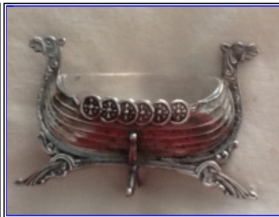
Silver Viking boat with clear glass insert

66 Nancy Dietel 07-21-2018 02:15 PM ET (US) IP: 100.8.174.253