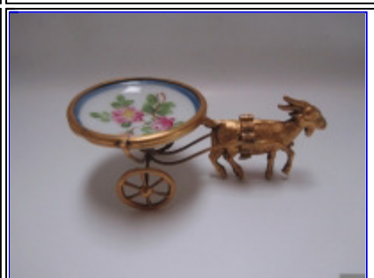
Goat with French porcelain salt.

38 Joan F. * 07-04-2018 10:48 PM ET (US) IP: 72.68.85.146