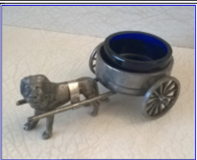
My Lion with the Wilcox plated cart I have inundated your incoming long enough - I shall return to see your new postings and add a few more of my own

63 Mary 07-21-2018 09:41 AM ET (US) IP: 72.220.215.254