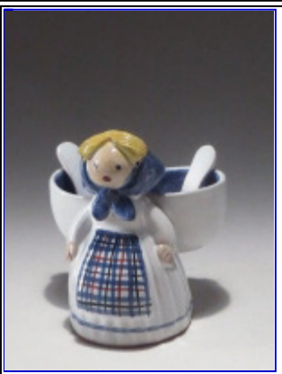
One more....they are both from Norway

33 Jytte 07-04-2018 05:22 PM ET (US) IP: 90.185.73.22