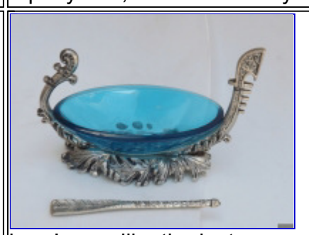
here's one like the last one, only a different color

16 Linda H 07-03-2018 12:30 PM ET (US) 174.217.48.154