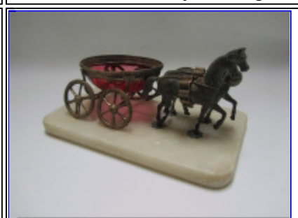
Horses with cranberry glass salt.