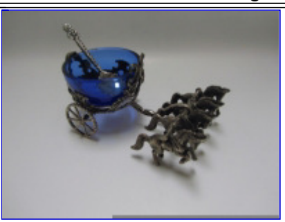
Another silver with four horses similar to (OSC Plate 307).

42 Joan F.★ 07-04-2018 10:53 PM ET (US) IP: 72.68.85.146