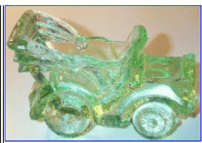
Probably not a salt. Maybe a candy container?

3 Debi Raitz 07-03-2018 06:56 AM ET (US) IP: 69.14.123.141