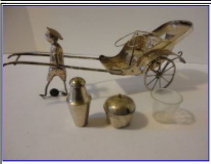
Rickshaw condiment set

65 Nancy Dietel 07-21-2018 02:13 PM ET (US) IP: 100.8.174.253