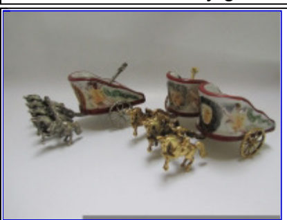
Horse & chariot salts. Single shown in OSC Plate 583.

43 Joan F.★ 07-04-2018 10:54 PM ET (US) ÎP: 72.68.85.146