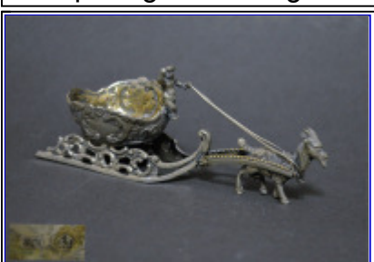
German goat pulling sleigh with rider

58 Mary 07-21-2018 09:34 AM ET (US) IP: 72.220.215.254