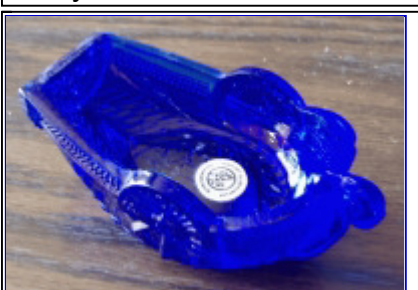
Sandwich Museum acorn boar

53 Nancy Dietel 07-13-2018 02:00 PM ET (US) IP: 100.8.174.253