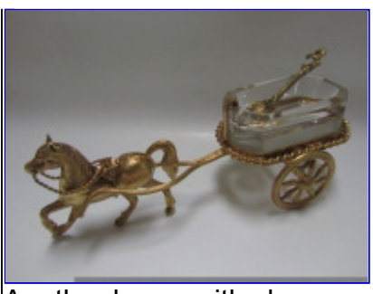
Another horse with clear crystal salt & matching horse salt spoon.

45 Joan F.★ 07-04-2018 10:57 PM ET (US) ÎP: 72.68.85.146