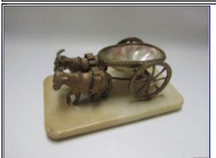
Goats with mother-of-pearl cart.