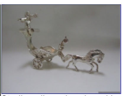
Sterling silver cherub and horse (OSC Plate 303).

40 Joan F.* 07-04-2018 10:51 PM ET (US) IP: 72.68.85.146