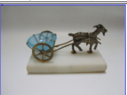
Another goat with blue opaline glass salt.

39 Joan F.★ 07-04-2018 10:50 PM ET (US) IP: 72.68.85.146