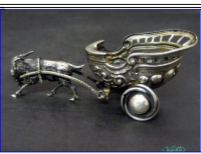
Goat pulling cart - He got rid of his rider with a whip a long time ago