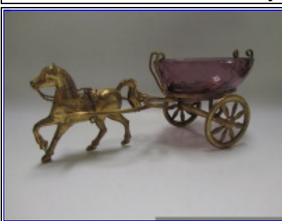
Horse with amethyst intaglio (OSC Plate 286).

45 Joan F.★ 07-04-2018 10:57 PM ET (US) ÎP: 72.68.85.146