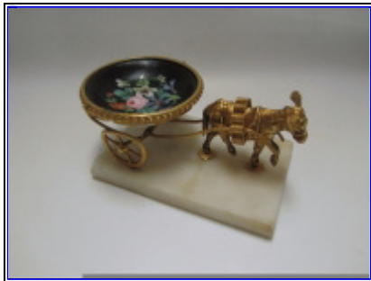
Donkey with French porcelain salt with enameled flowers.

40 Joan F.* 07-04-2018 10:51 PM ET (US) IP: 72.68.85.146