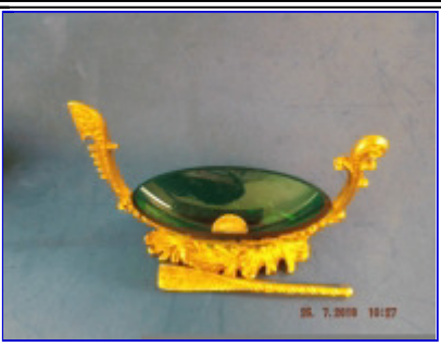
a different viking boat

15 Linda H 07-03-2018 12:27 PM ET (US) 174.217.48.154