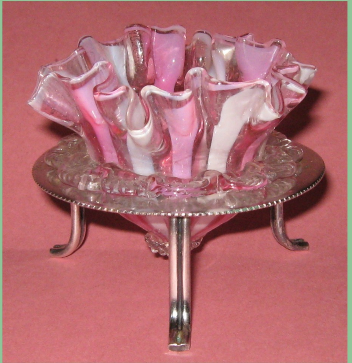
One of my favorites...