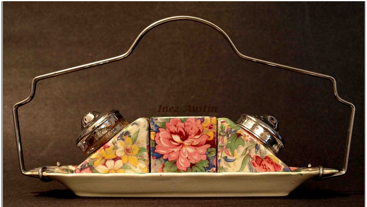
Springtime - Made in England, Midwinter c1940s

4 Inez Austin 04-02-2012 02:08 AM ET (US) IP: 50.46.35.19