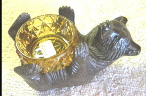
Reclining Black Forest Bear holding his salt.