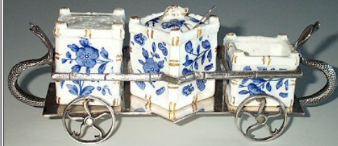
Guess I can throw in a condiment set too. This one is a pretty unique holder.

81 Debi Raitz 04-11-2012 10:35 PM ET (US) IP: 24.192.249.13