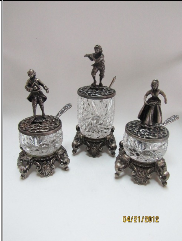
A favorite English condiment set made of silver plated heavy base metal.

161 Joan F. 04-23-2012 11:12 AM ET (US) IP: 72.76.142.66