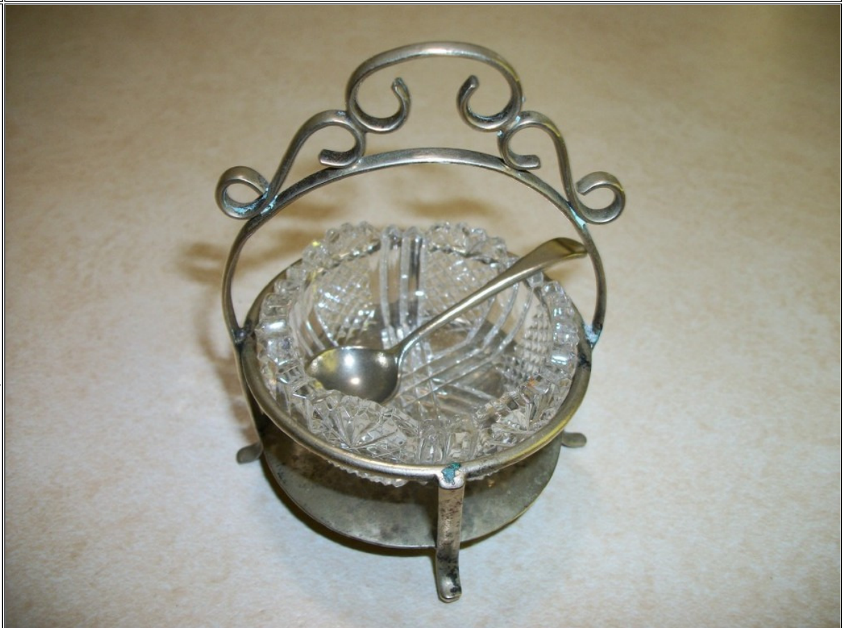
This round holder with the Ornate scrolls at the top also made in England. No Makers Mark