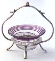
Clear with amethyst threading

85 Debi Raitz 04-11-2012 10:44 PM ET (US) IP: 24.192.249.13