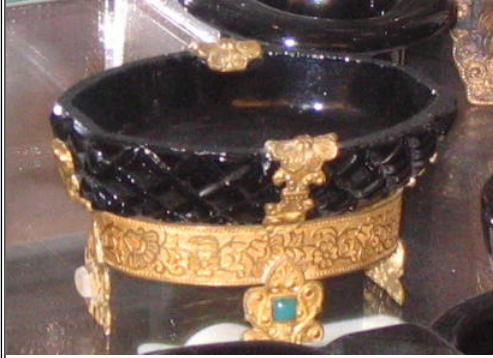
An intaglio sitting on top of the stand - m

18 Mary Kern 04-03-2012 08:08 PM ET (US) IP: 72.220.213.56