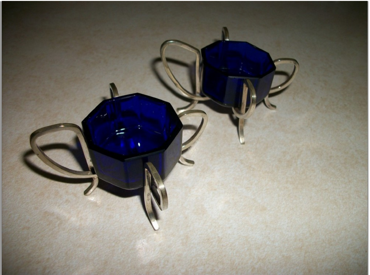
Found these hiding among the other salts. I definately need a bigger cabinet.

141 Susie P 04-17-2012 07:10 AM ET (US) IP: 198.228.226.171