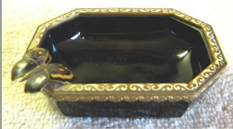
Hoffmann Jett glass with enameled butterfly perched on the frame.

25 Jane Koble 04-05-2012 01:03 PM ET (US) IP: 98.237.114.93