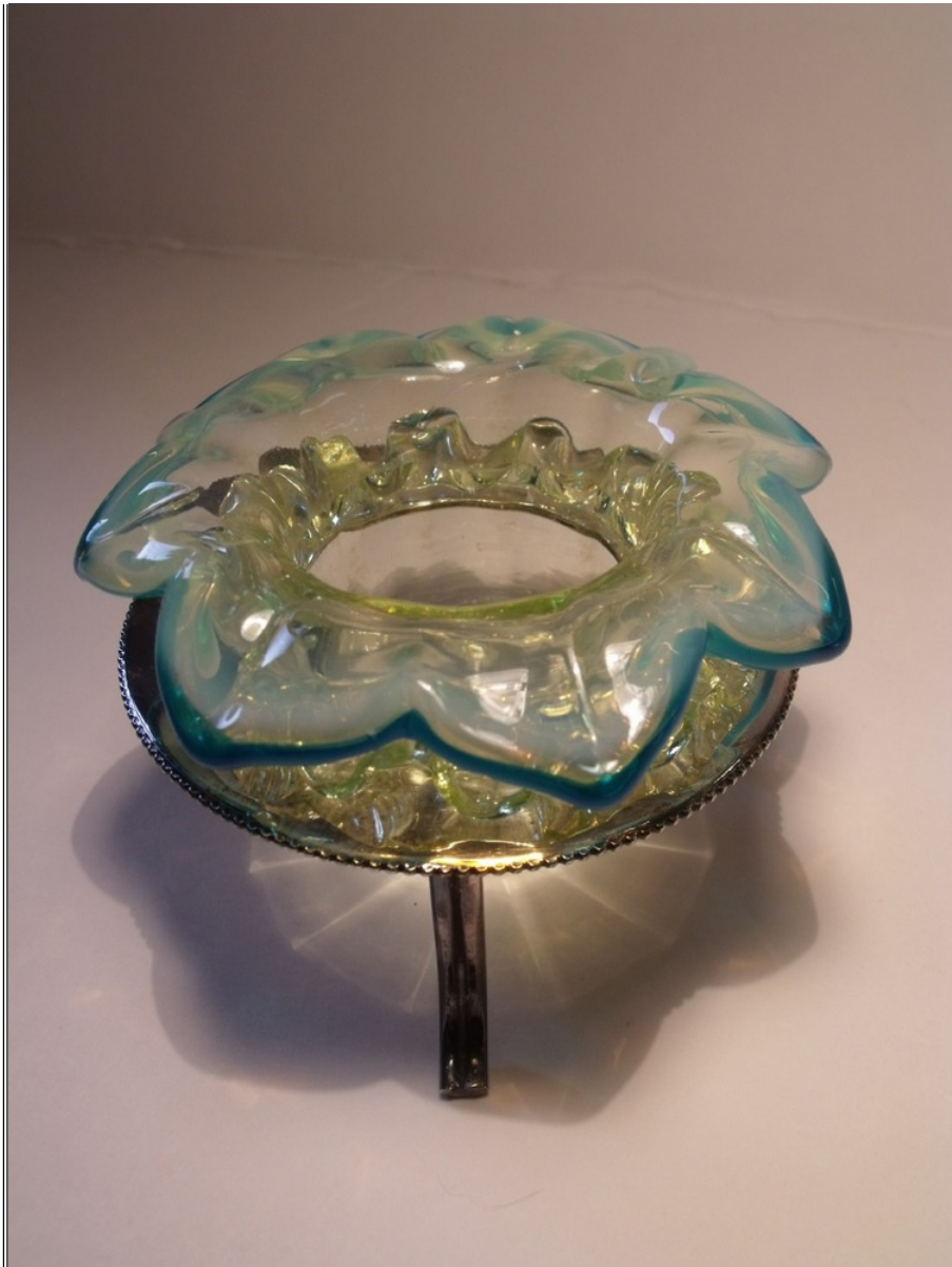
another vaseline; love the blue edging

118 Susie P 04-15-2012 09:48 AM ET (US) IP: 209.132.170.72