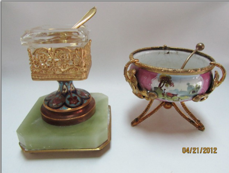
Enamel & vermeil on marble base. Battersea in ormulo stand.