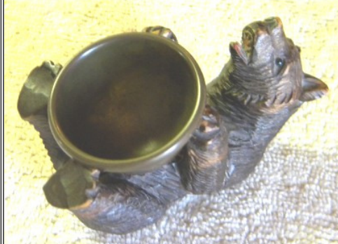
Another Black Forest Bear holding his brass salt.