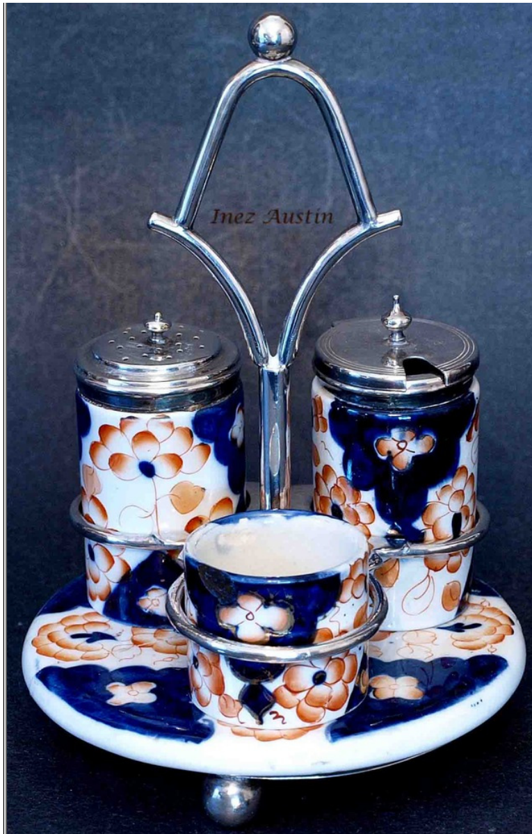
The last one I have with a holder in the same material as the salt. Gaudy Dutch