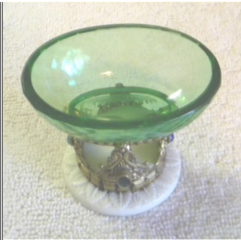
Pheasant salt on jeweled frame and alabaster base.

33 Jane Koble 04-05-2012 01:11 PM ET (US) IP: 98.237.114.93