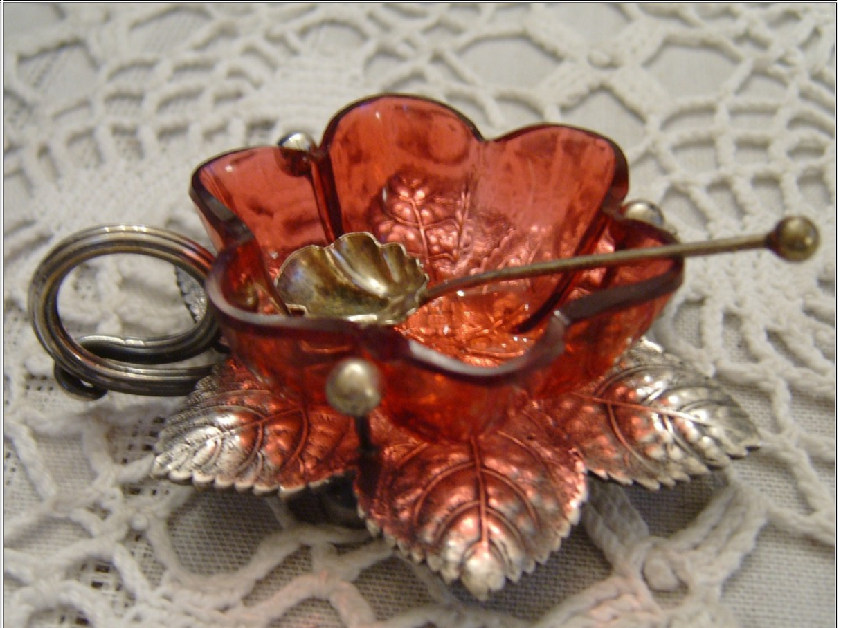
Purchased from Nina...years ago...

62 Lyleann 04-06-2012 01:53 AM ET (US) IP: 69.122.249.138