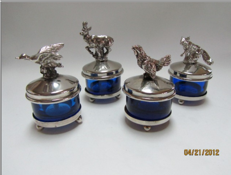
Silver animal finial salts ~ a goose, an elk, an eagle & a fox ~ OSC 319.