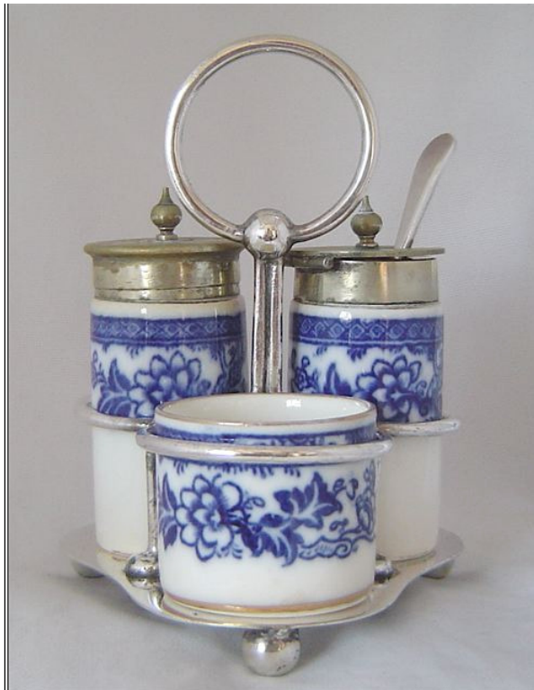
Crescent China set. Pagoda on the other side of the salt.

145 Nancy Villaverde 04-21-2012 09:15 PM ET (US) IP: 50.113.37.87