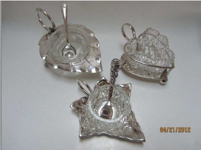
English EPNS stands/holders with clear cut glass salts.

159 Joan F. 04-23-2012 11:10 AM ET (US) IP: 72.76.142.66