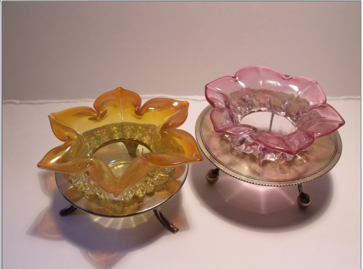
flower like salts

109 Susie P 04-15-2012 09:40 AM ET (US) IP: 209.132.170.72