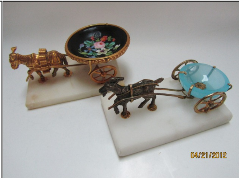
Donkey & goat cart salts.