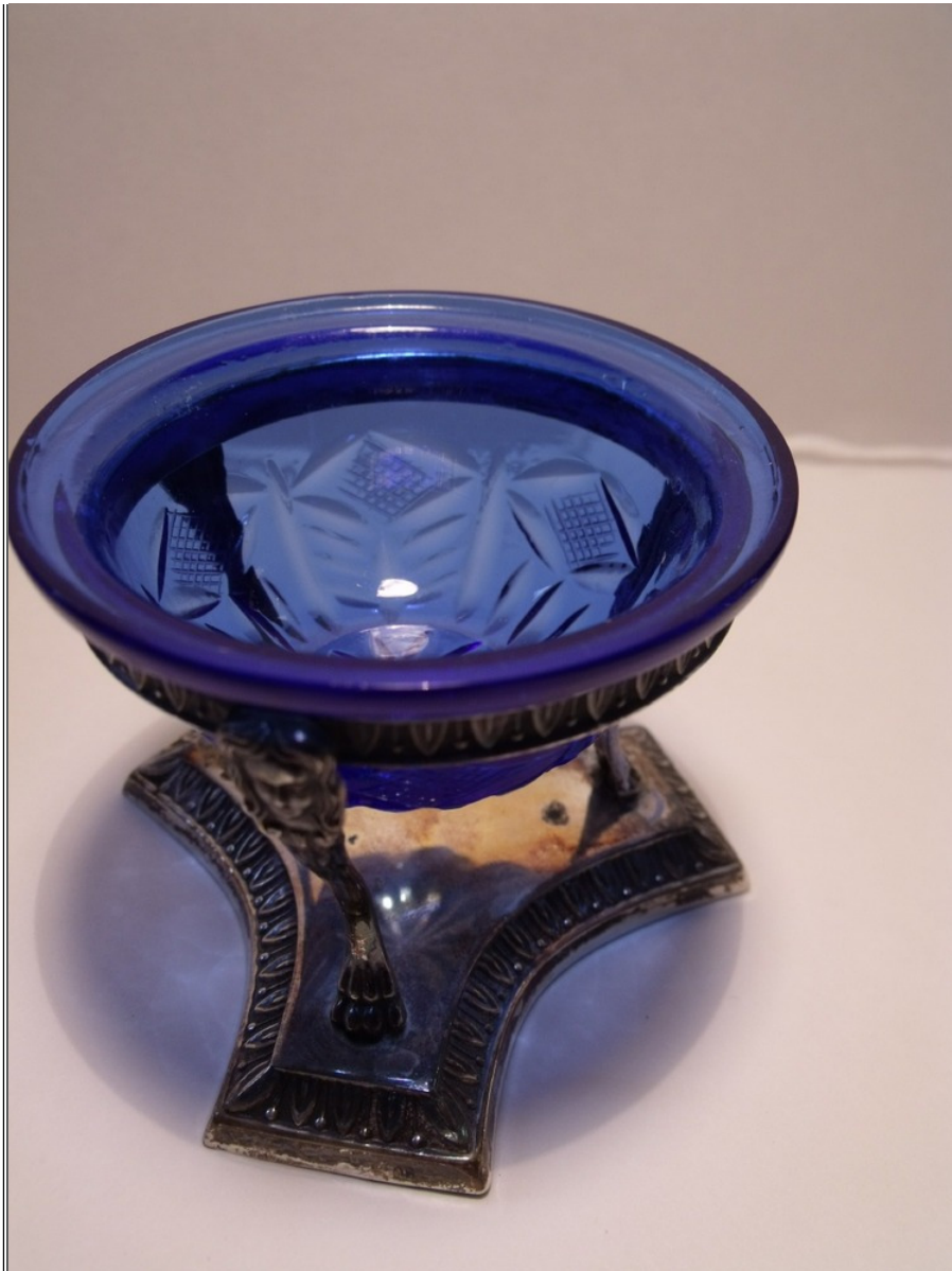
another blue; love the holder

112 Nancy Dietel 04-15-2012 09:42 AM ET (US) IP: 173.63.90.171