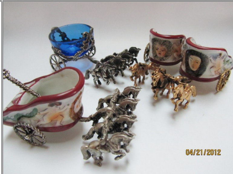
Silver w/cobalt liner horse cart & Capodimonte chariot salts ~ OSC 583.

153 Joan F. 04-23-2012 11:03 AM ET (US) IP: 72.76.142.66