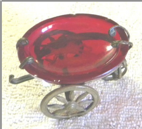
Red intaglio in brass cart frame.

34 Jane Koble 04-05-2012 01:12 PM ET (US) IP: 98.237.114.93