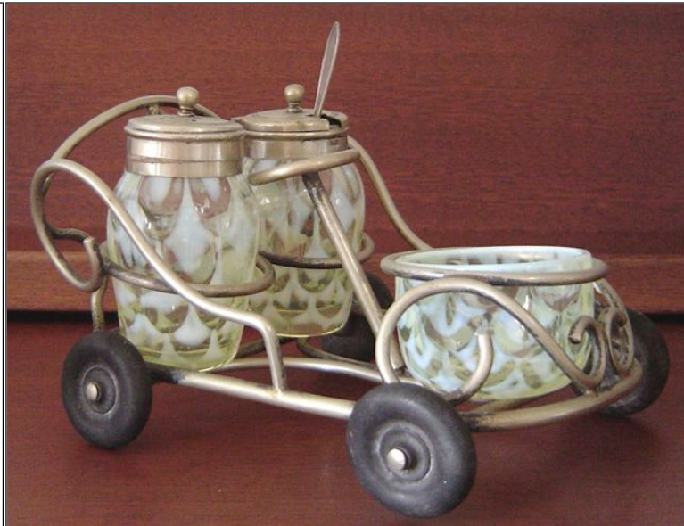
Vaseline patterned set in a wire buggy

43 Nancy Villaverde 04-05-2012 07:37 PM ET (US) IP: 50.113.33.164