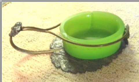
This one is in bad shape, but it is still pretty - and it was cheap so I couldn't pass it up!

31 Jane Koble 04-05-2012 01:09 PM ET (US) IP: 98.237.114.93