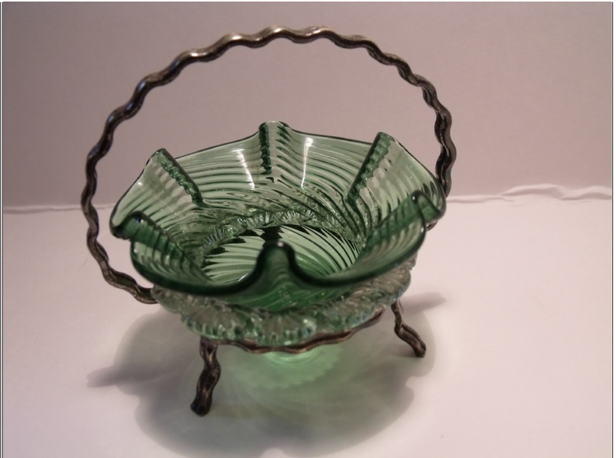
green version of the blue earlier

Susie P 04-15-2012 09:53 AM ET (US) IP: 209.132.170.72