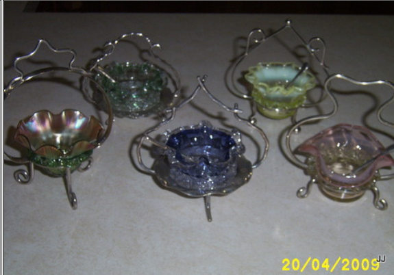
More English salts in holders

14 Janelle Jefferson 04-03-2012 12:51 AM ET (US) IP: 124.169.12.62