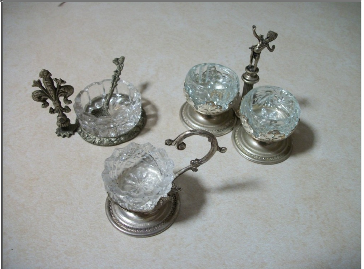
Italian salts -very common and not that old

99 Janelle Jefferson 04-14-2012 06:00 AM ET (US) IP: 210.84.12.85