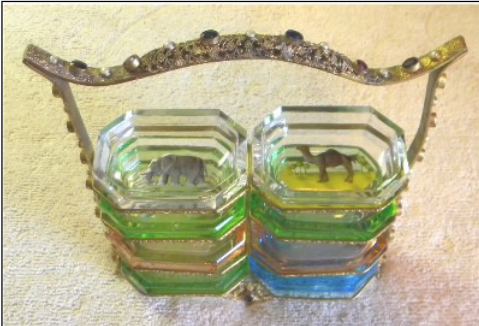
Jeweled frame with eight salts.

26 Jane Koble 04-05-2012 01:04 PM ET (US) IP: 98.237.114.93