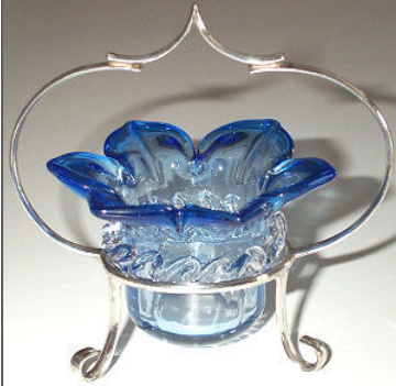
One of my blue shaded to clear...Bluina Glass

79 Debi Raitz 04-11-2012 10:29 PM ET (US) IP: 24.192.249.13