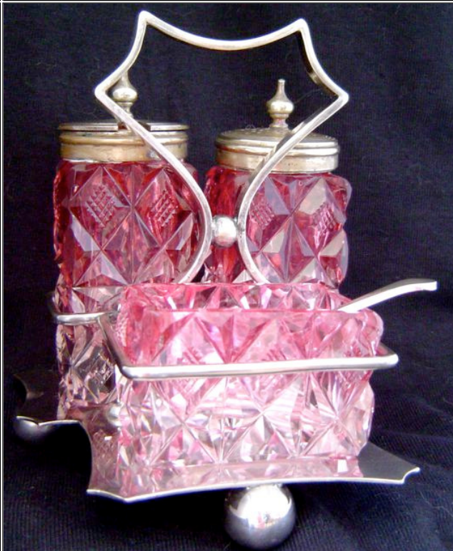
Cut glass cranbery set

41 Nancy Villaverde 04-05-2012 07:21 PM ET (US) IP: 50.113.33.164