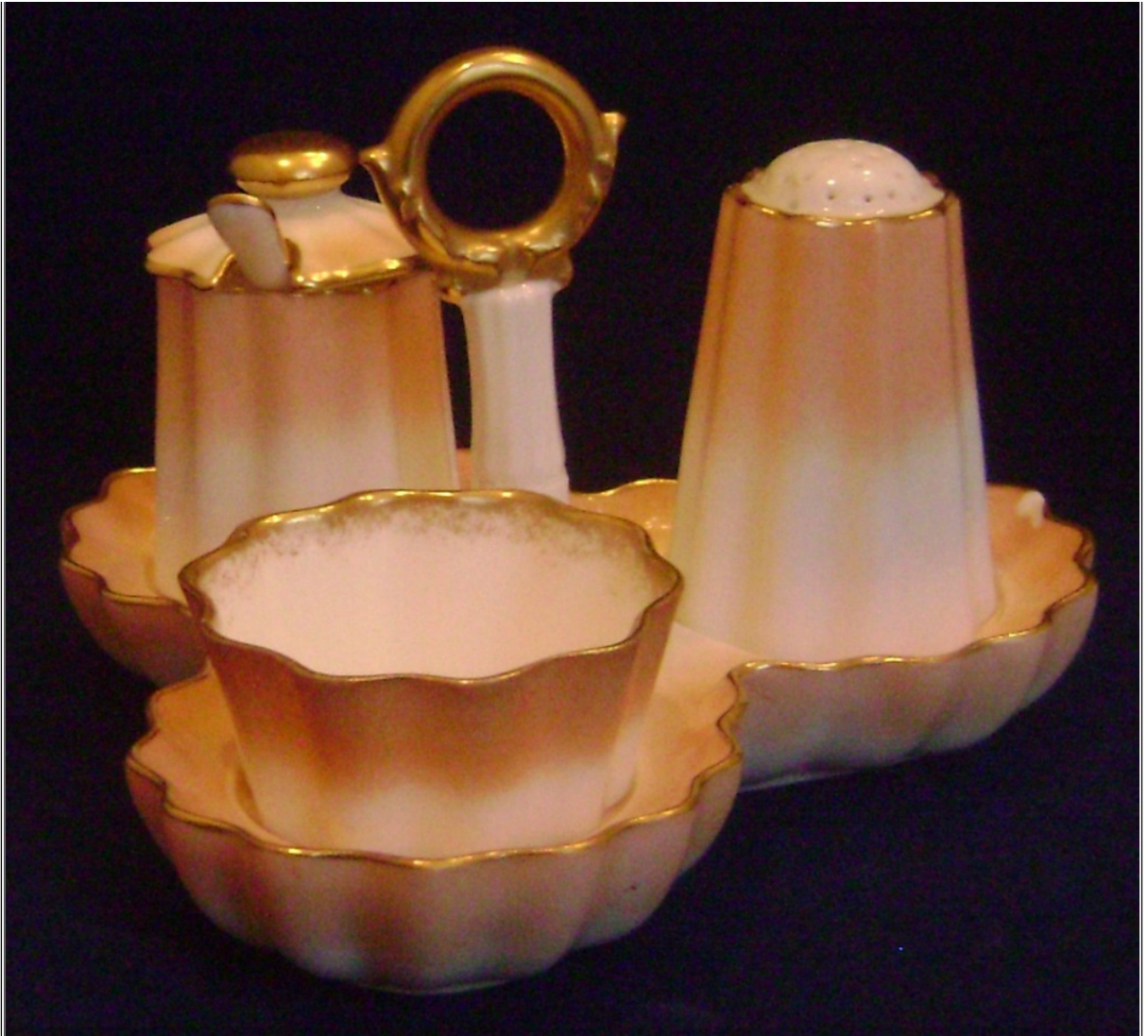
Marked Doulton Burslem with crown.

8 Kent Hudson 04-02-2012 01:08 PM ET (US) IP: 108.4.14.199