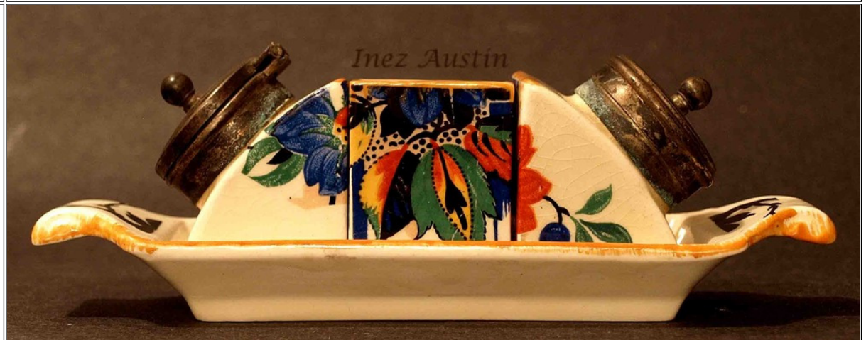
This set is very small, almost half the size of the other Midwinter set, Made in England EPNS c1920s-1930s based on the tops

4 Inez Austin 04-02-2012 02:08 AM ET (US) IP: 50.46.35.19