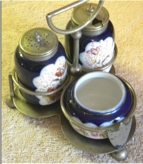
Pink flowers on cobalt background with gold trim. The frame is signed with an "S" in a diamond, "Electroplated on Nickel Silver, 30".

41 Nancy Villaverde 04-05-2012 07:21 PM ET (US) IP: 50.113.33.164