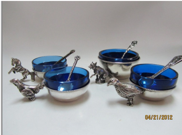
More silver animal salts ~ horse, eagle, fox & partridge.

153 Joan F. 04-23-2012 11:03 AM ET (US) IP: 72.76.142.66