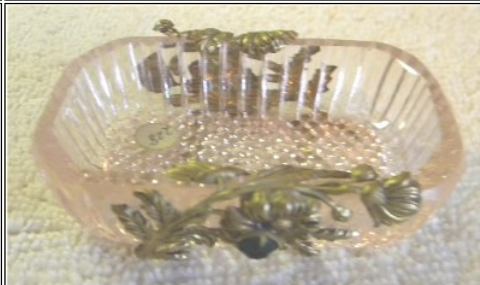
Ribbed salt with jeweled frame.

28 Jane Koble 04-05-2012 01:06 PM ET (US) IP: 98.237.114.93