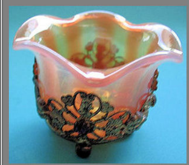
One more today - Monot Stumpf

20 Mary Kern 04-03-2012 08:40 PM ET (US) IP: 72.220.213.56