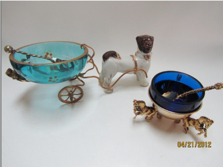
Dog cart & gold plated horses w/cobalt liner.