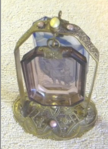
Two salts on hanging from jeweled frame.

24 Jane Koble 04-05-2012 01:02 PM ET (US) IP: 98.237.114.93