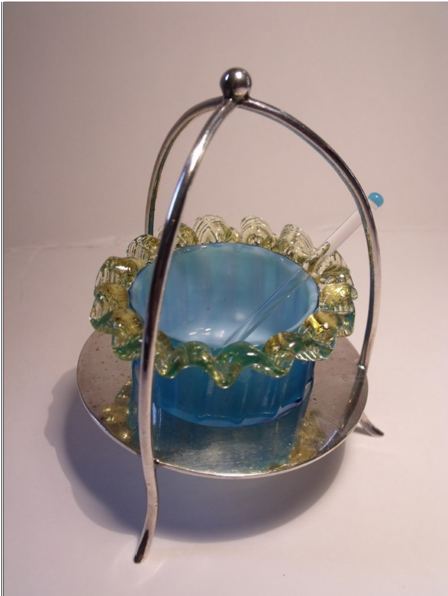
love the color and matching spoon

119 Susie P 04-15-2012 09:50 AM ET (US) IP: 209.132.170.72