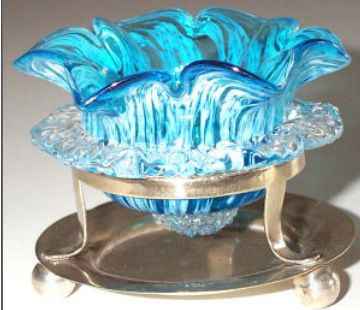
Peloton (or however it's spelled!)

78 Debi Raitz 04-11-2012 10:28 PM ET (US) IP: 24.192.249.13