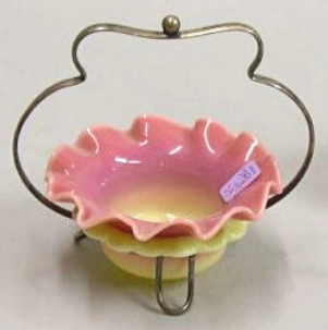
Not mine, but a picture I saved because I LOVE IT!

85 Debi Raitz 04-11-2012 10:44 PM ET (US) IP: 24.192.249.13