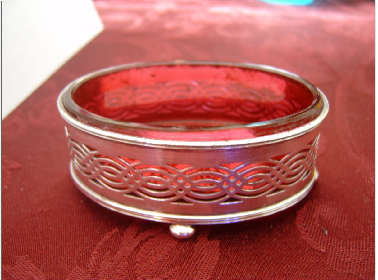
From Cackey's collection...

60 Lyleann 04-06-2012 01:51 AM ET (US) IP: 69.122.249.138