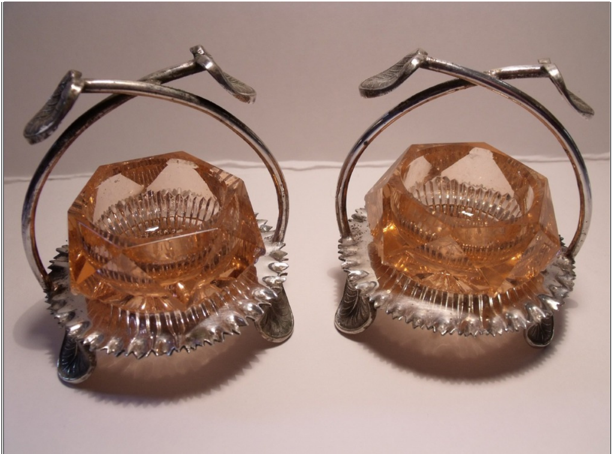
marriage? and see, still have some doubles :) :) also, these are larger than the salts in the first set.....