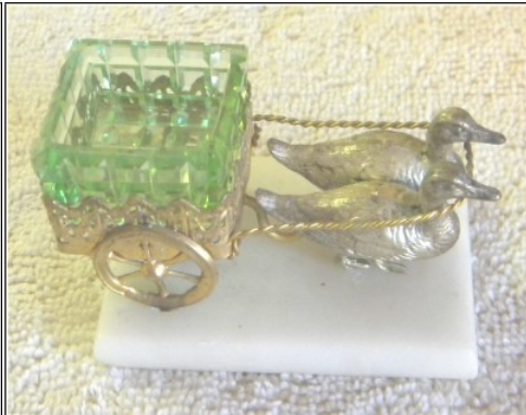
Duck cart with green cut glass salt.

33 Jane Koble 04-05-2012 01:11 PM ET (US) IP: 98.237.114.93