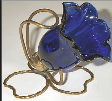
Cobalt glass tulip in holder.

82 Debi Raitz 04-11-2012 10:36 PM ET (US) IP: 24.192.249.13