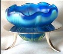
Shades of blue with some vaseline glass.

77 Debi Raitz 04-11-2012 10:27 PM ET (US) IP: 24.192.249.13