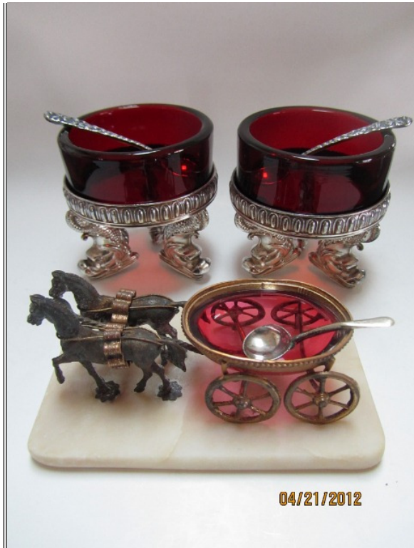
Cranberry glass horse cart & silver dolphin stands w/ ruby liners. Stands marked Pairpoint.

161 Joan F. 04-23-2012 11:12 AM ET (US) IP: 72.76.142.66