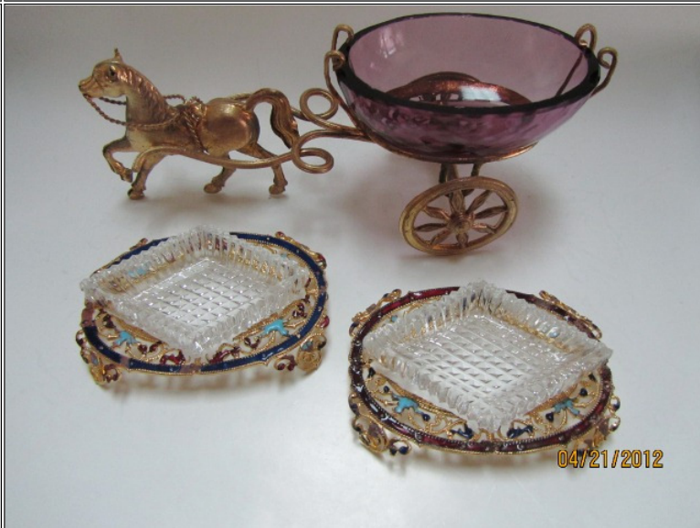
Intaglio horse cart & two french champeve enamel salts.

159 Joan F. 04-23-2012 11:10 AM ET (US) IP: 72.76.142.66