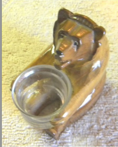
Foreign carved wooden bear holding his salt. This has a paper stamp on the bottom, but I have been able to find out what language it is printed in.

37 Jane Koble 04-05-2012 01:15 PM ET (US) IP: 98.237.114.93