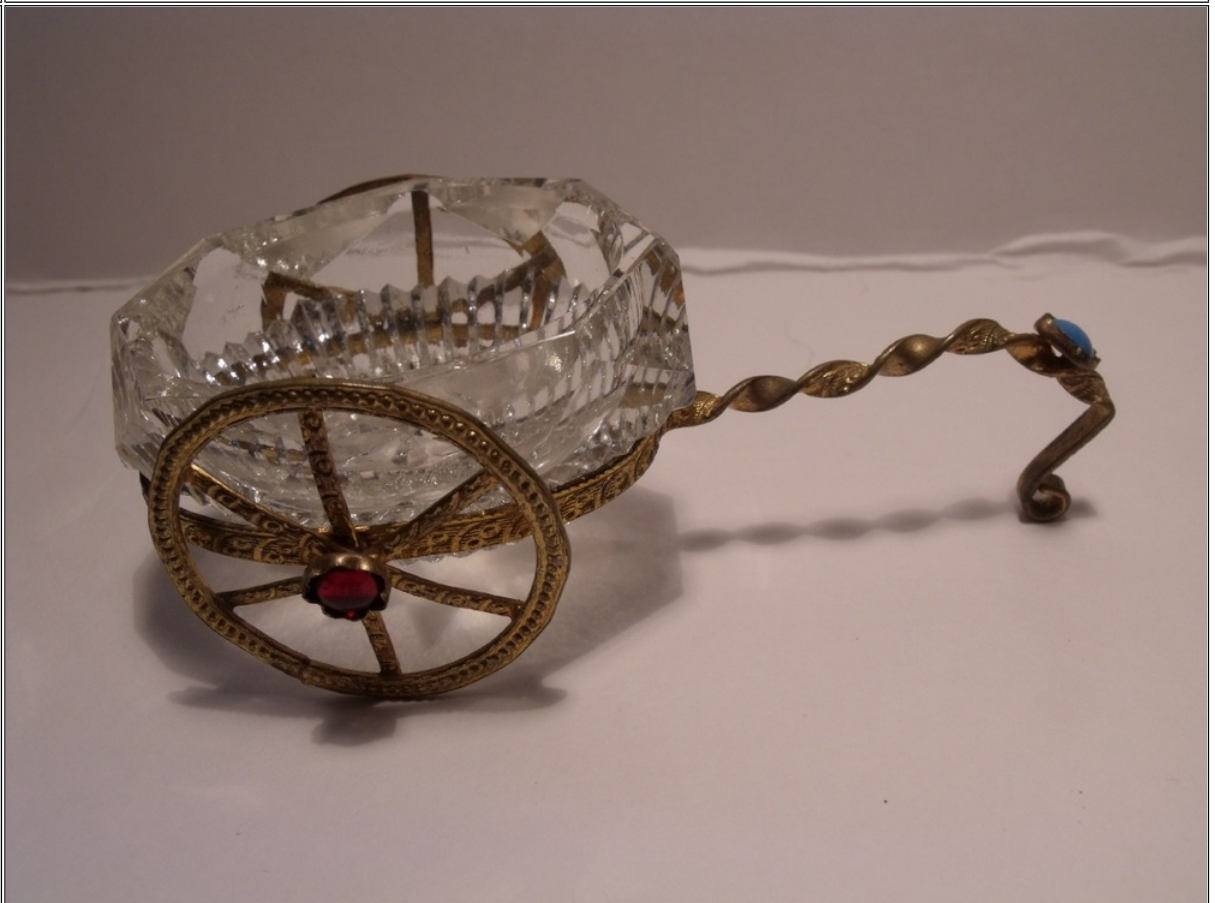
love this holder; would love to find a more colorful salt for it :)

120 Susie P 04-15-2012 09:53 AM ET (US) IP: 209.132.170.72