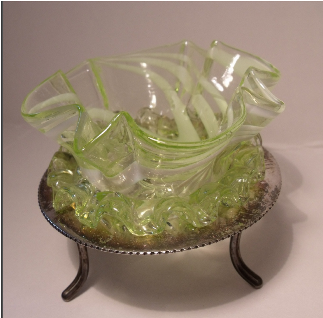
i believe vaseline glass, one of my favorites

115 Susie P 04-15-2012 09:45 AM ET (US) IP: 209.132.170.72