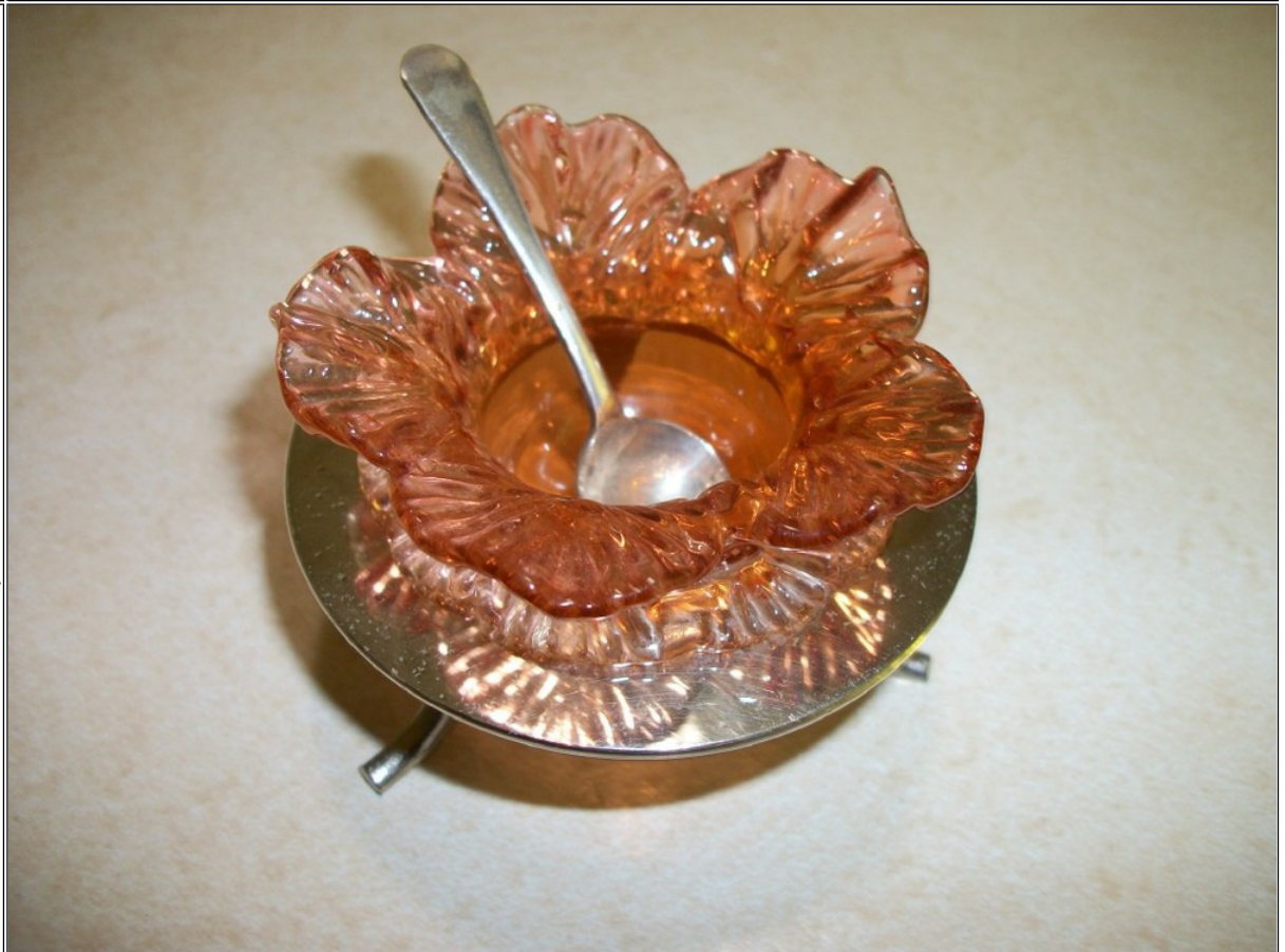
Apricot flower salt in stand - It is such a pretty colour.

53 Janelle Jefferson 04-05-2012 11:45 PM ET (US) IP: 203.214.152.167