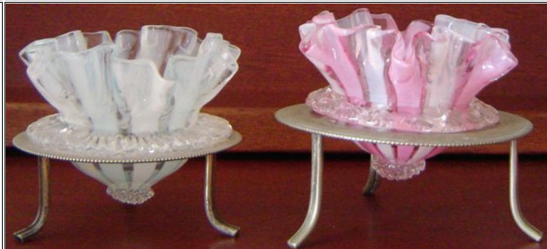
Near match in candy striped blue and pink

44 Nancy Villaverde 04-05-2012 07:48 PM ET (US) IP: 50.113.33.164