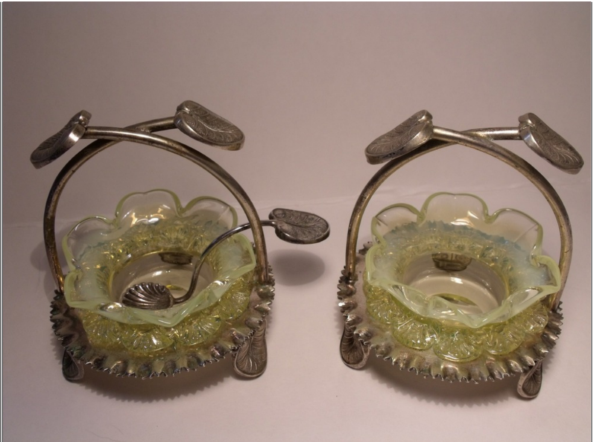
Love the matching spoon in one of these.....these are almost my favorite stands