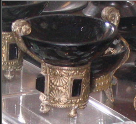
I love these - Have a pink and a blue in different shapes also -

18 Mary Kern 04-03-2012 08:08 PM ET (US) IP: 72.220.213.56