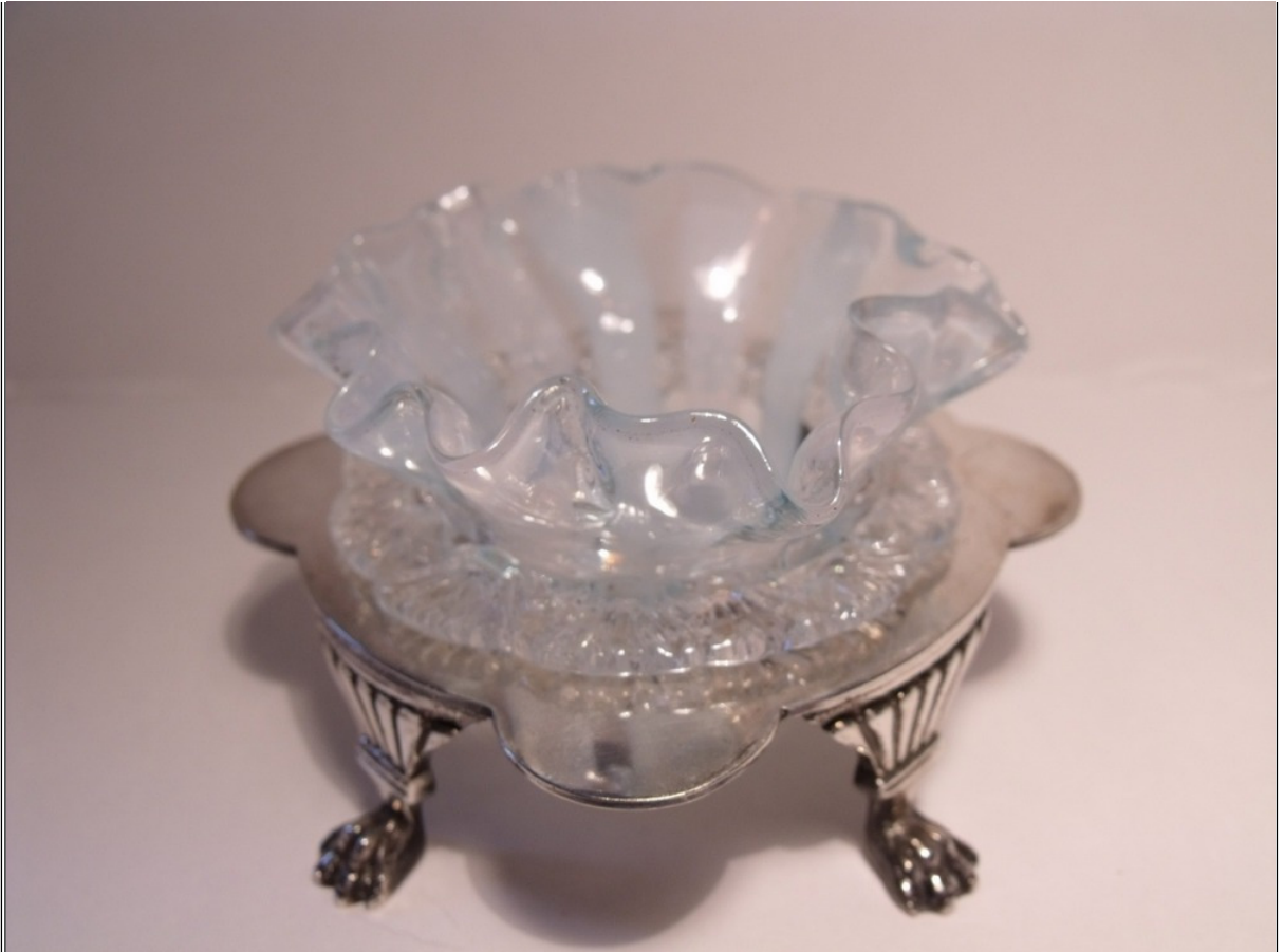
hard to get a good photo, incredibly soft blue and white.....

117 Susie P 04-15-2012 09:47 AM ET (US) IP: 209.132.170.72