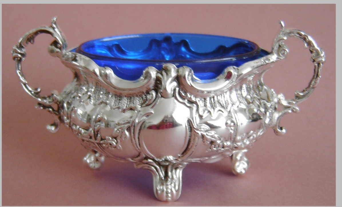
A sterling cobalt from Israel...

Lyleann 04-06-2012 01:52 AM ET (US) IP: 69.122.249.138