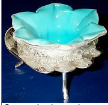
Cased glass in an odd shell-shaped holder.

75 Debi Raitz 04-11-2012 10:25 PM ET (US) IP: 24.192.249.13