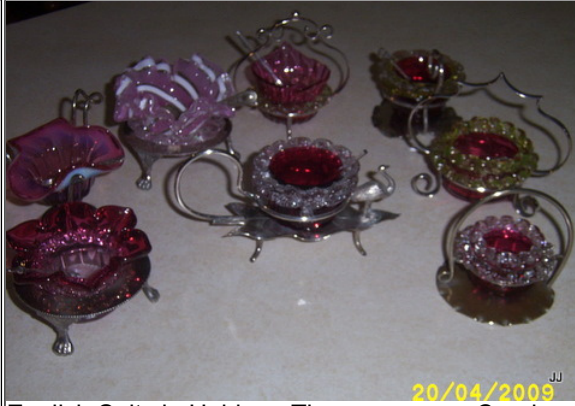
English Salts in Holders. These ones are Cranberry

13 Janelle Jefferson 04-03-2012 12:50 AM ET (US) IP: 124.169.12.62