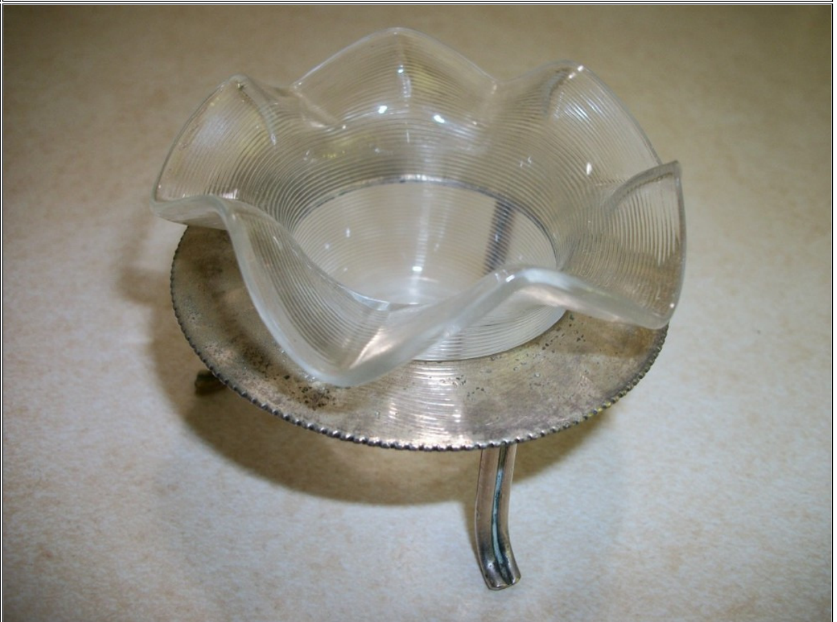
Clear glass salt with threading

101 Janelle Jefferson 04-14-2012 06:07 AM ET (US) IP: 210.84.12.85