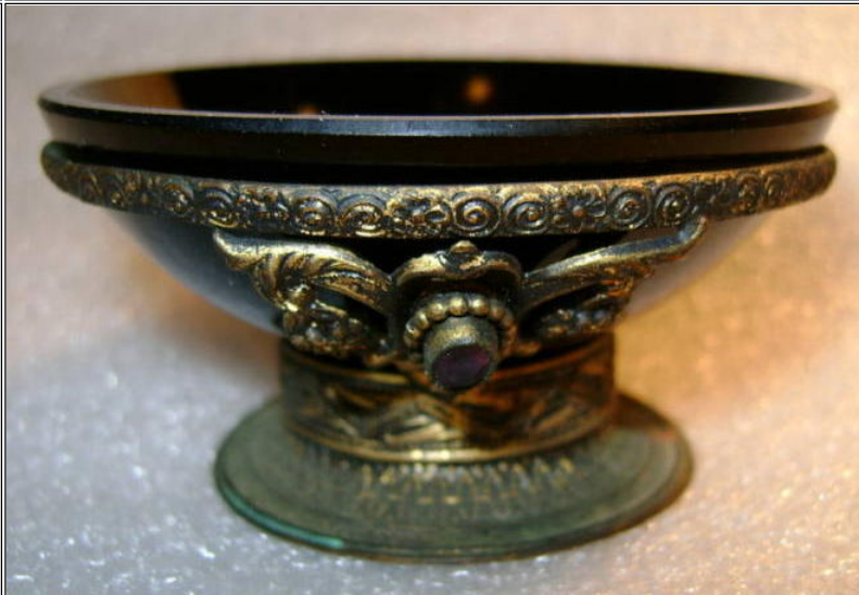
These are some of my black glass pieces in holders and I think most of the salt shows - I think I showed this before but the holder is just a stand and a circle - so the salt bowl is shown rim and bottom - m

16 Mary Kern 04-03-2012 07:38 PM ET (US) IP: 72.220.213.56