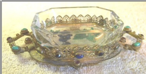
Jeweled and handled frame.

29 Jane Koble 04-05-2012 01:07 PM ET (US) IP: 98.237.114.93