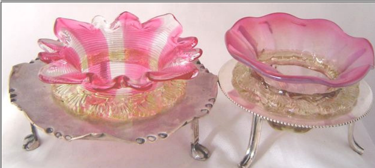
View from above.

66 Nancy Villaverde 04-06-2012 05:25 PM ET (US) IP: 50.113.33.164