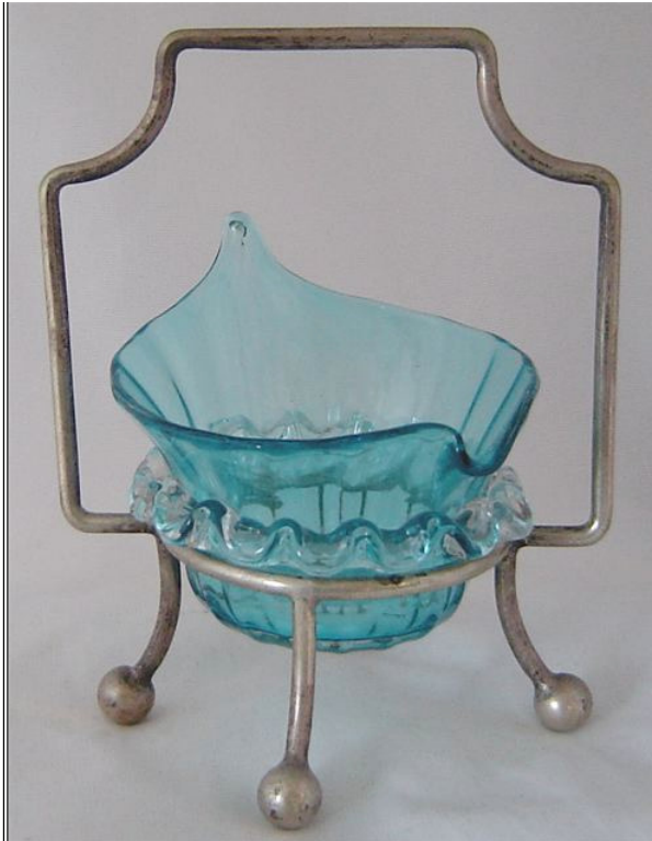
Blue salt in stand, like #95

Nancy Villaverde 04-14-2012 07:32 PM ET (US) IP: 67.49.153.129