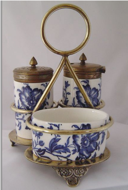
Blue and white porcelain set Misspelled cranberry on the previous one, should have said one like it in OSC with 4 pieces, Plate 334.

43 Nancy Villaverde 04-05-2012 07:37 PM ET (US) IP: 50.113.33.164