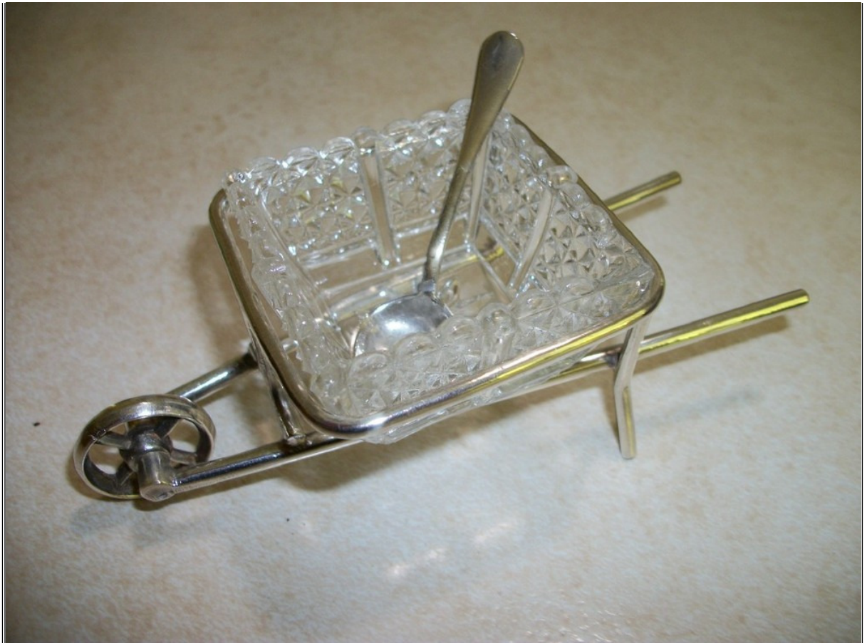
Wheelbarrow frame also made in England