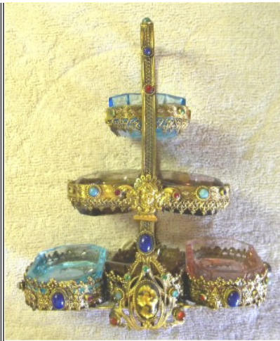
Heavily jeweled frame with six salts.

28 Jane Koble 04-05-2012 01:06 PM ET (US) IP: 98.237.114.93