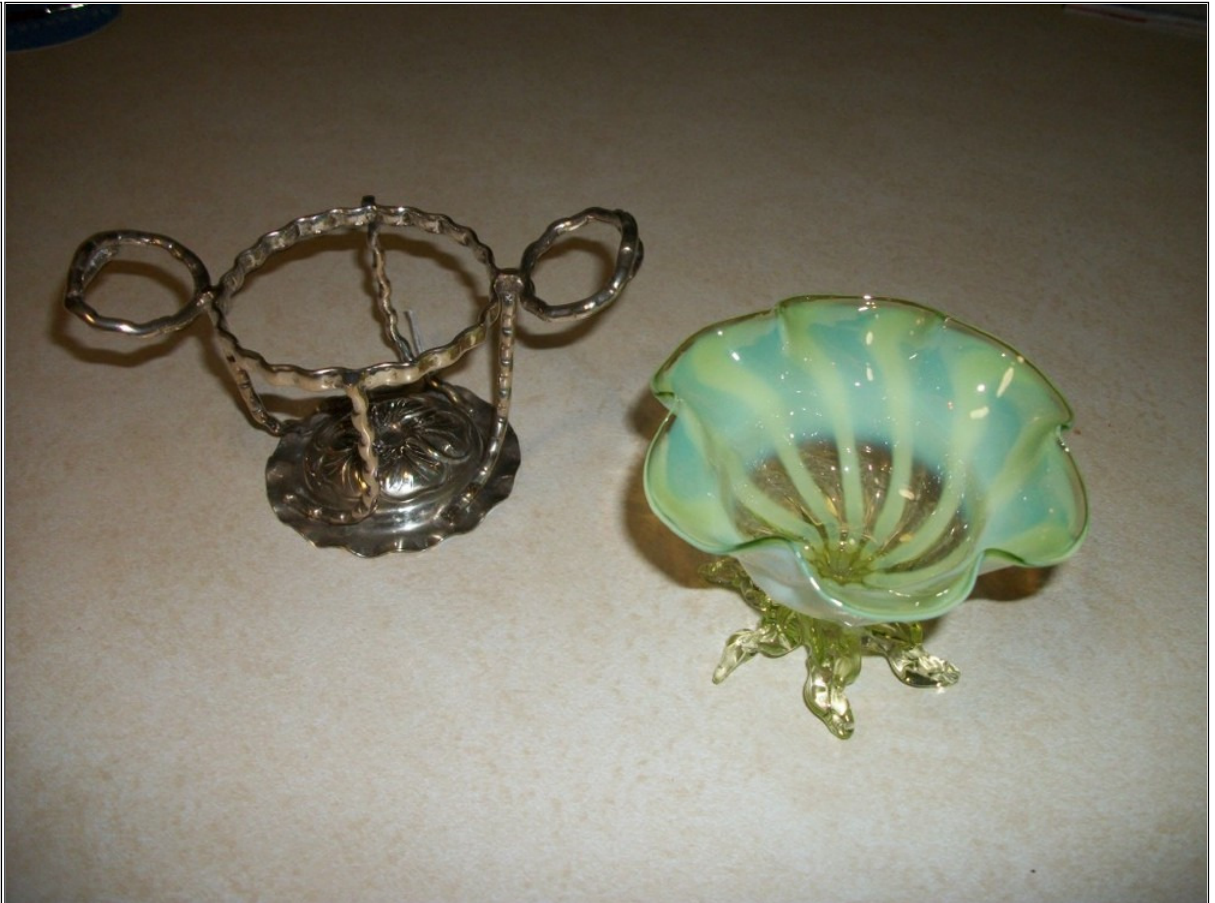
The "salt" and stand separate.

139 Janelle Jefferson 04-17-2012 03:20 AM ET (US) IP: 124.169.21.93