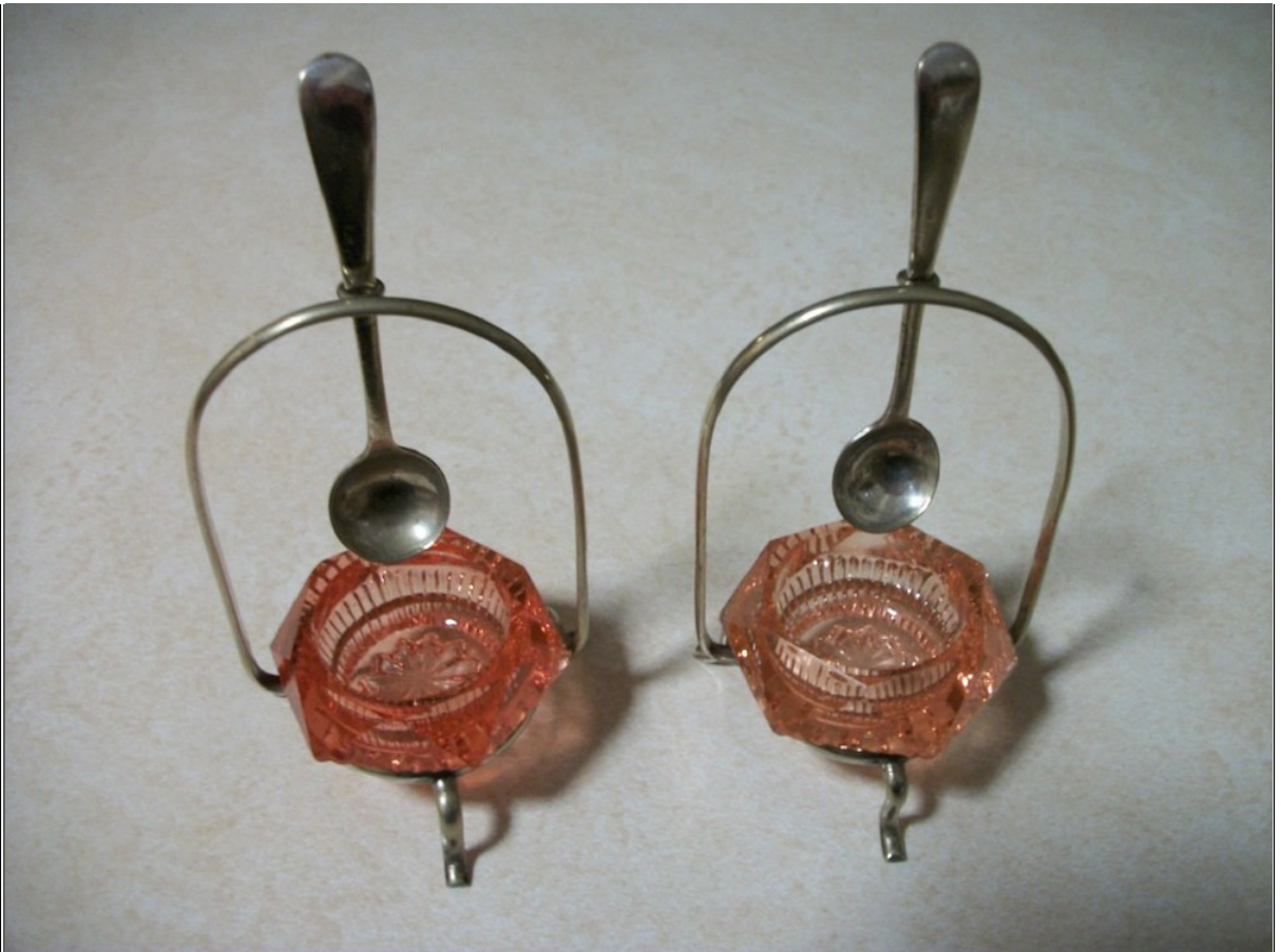
Pink/apricot salts with spoons in frames

Janelle Jefferson 04-14-2012 06:06 AM ET (US) IP: 210.84.12.85