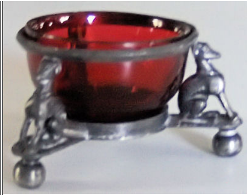
Sold as pigeon blood glass, but I'm not sure exactly what that is. Looks red to me.

81 Debi Raitz 04-11-2012 10:35 PM ET (US) IP: 24.192.249.13