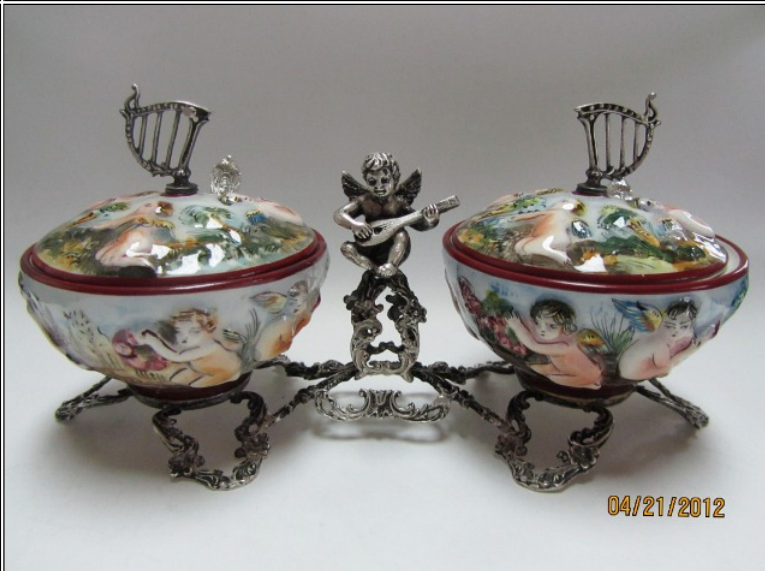
Capodimonte double on 800 silver stand ~ OSC 662.

157 Joan F. 04-23-2012 11:07 AM ET (US) IP: 72.76.142.66