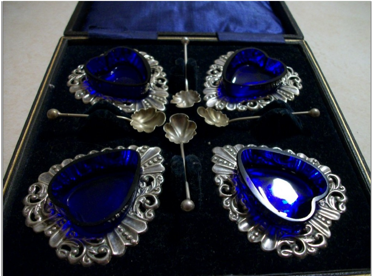
Boxed set of Bristol Blue salts in heart frames