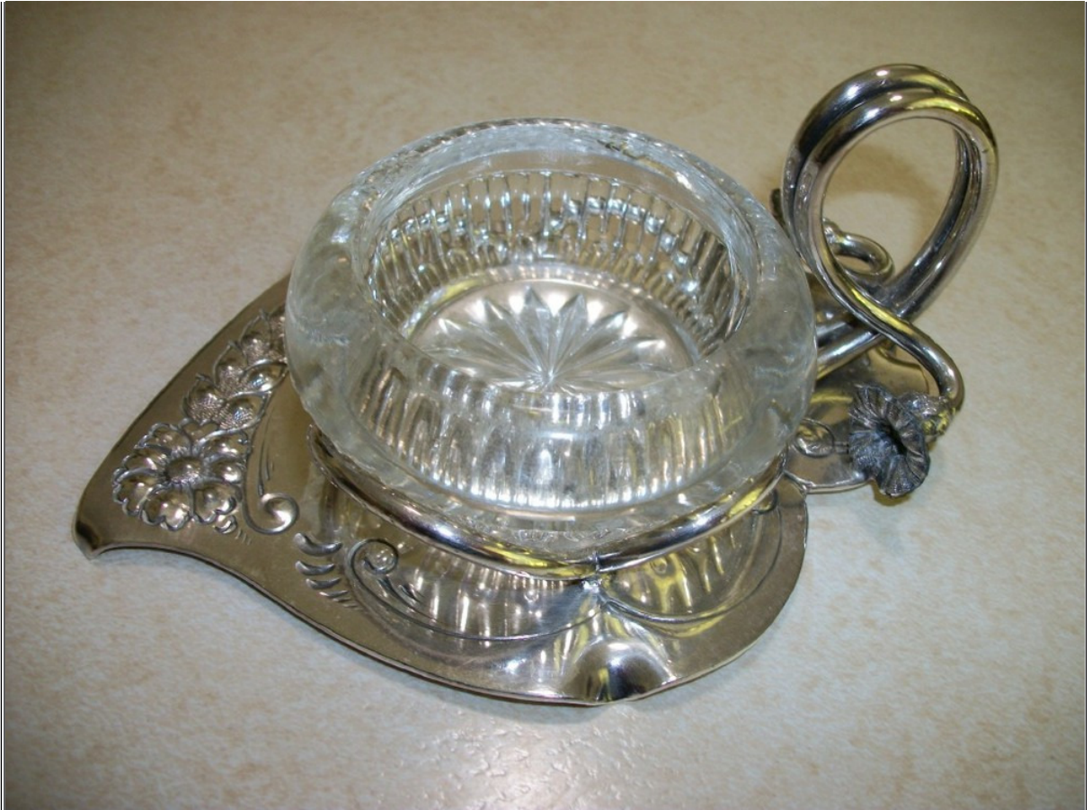
James Dixon Master Salt. The Glass Has some bulls eye damage but I love the work in the frame. The frame is made in EPBM ( Electro Plated British Metal) which is collectable in its own right and also James Dixon is a very collectable maker. One of my earlies salts fromwhen I started collecting.