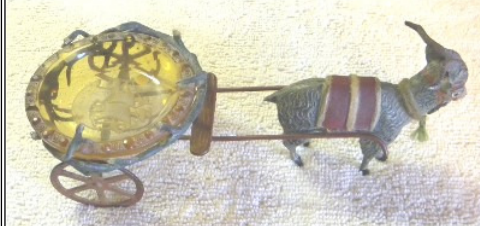
Goat cart: Enameled metal goat; twigs holding salt in place.

30 Jane Koble 04-05-2012 01:08 PM ET (US) IP: 98.237.114.93