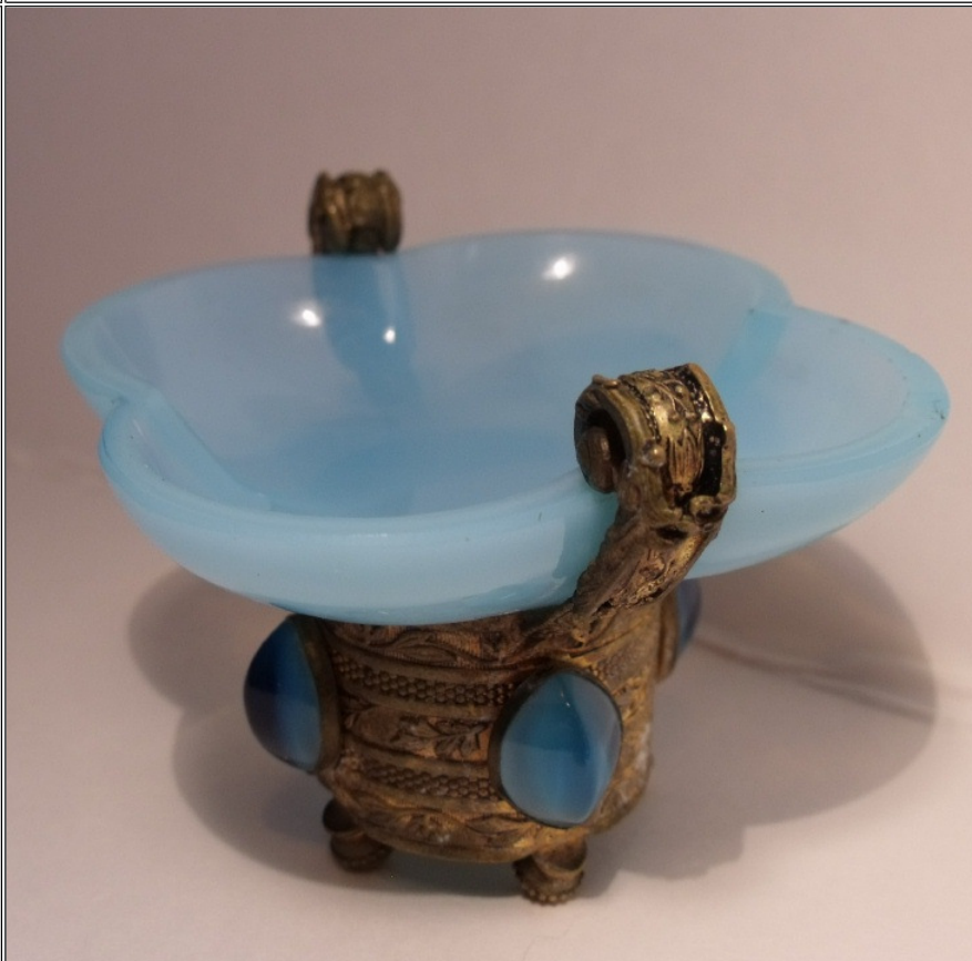
love this opaline salt

122 Susie P 04-15-2012 09:54 AM ET (US) IP: 209.132.170.72