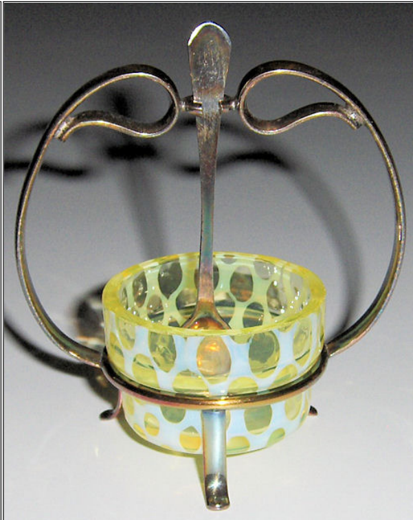
Had this one a long time.