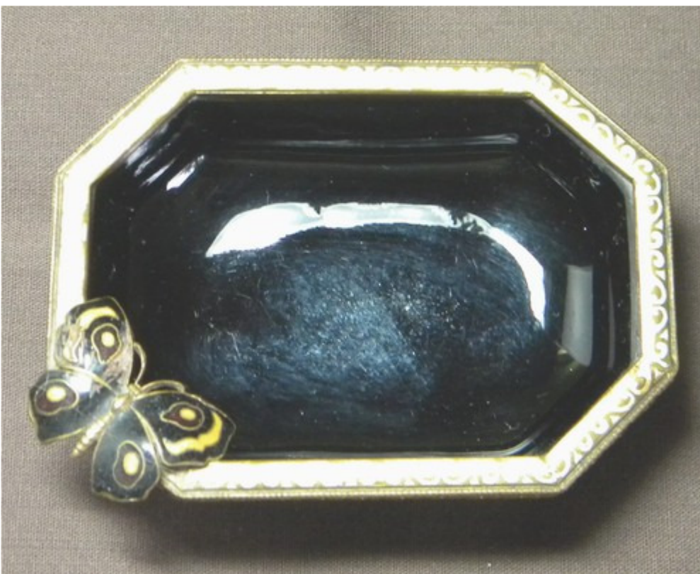
Hoffmann's Jett glass. Not intaglio cut but a nice enameled frame.