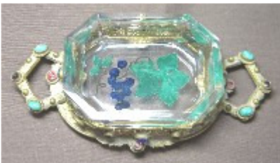
Flat frame with handles and enameled intaglio.