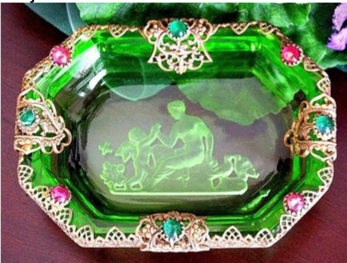
I was so lucky ... This salt is in great condition.