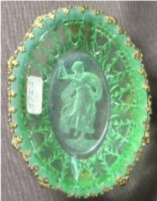
Top of frame.