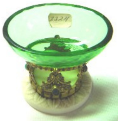
Jeweled frame on a carved marble base.