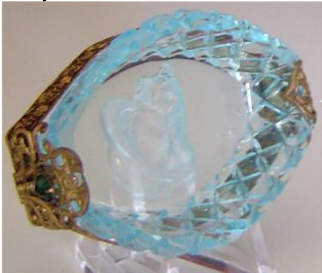
Cat in Hat intaglio in frame with jewels at the ends.