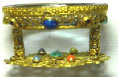
Side view of frame with two "posts".