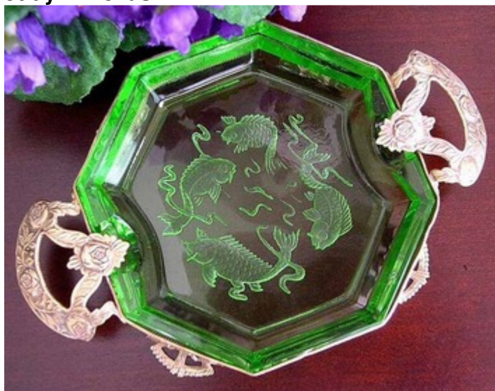
Found with a group of ASHTRAYS - No markings on the glass or frame