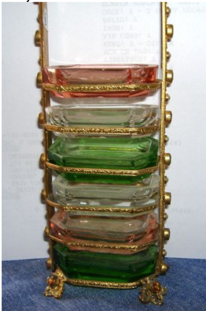
Intaglio tree with pink, green, clear salts