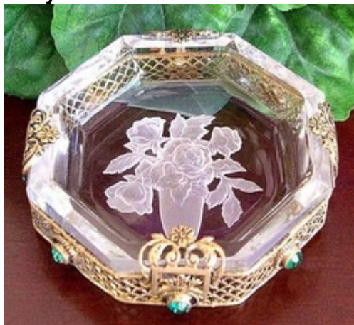
One from my "Clear Period"