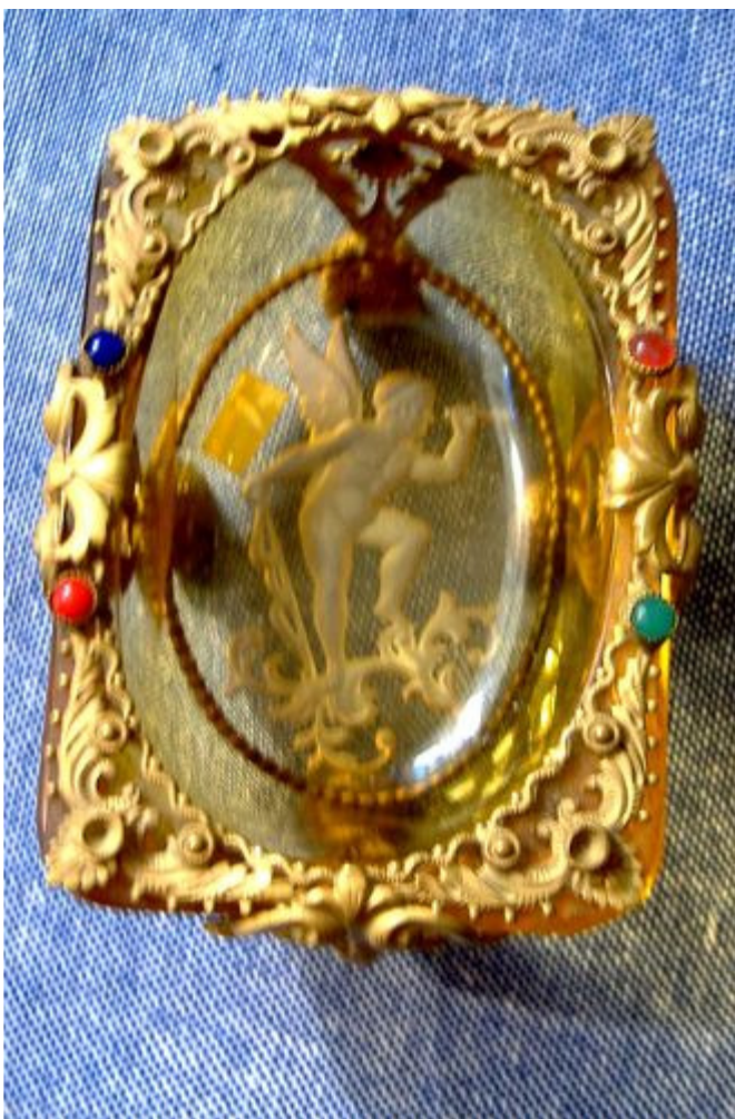
This has filagree ball feet