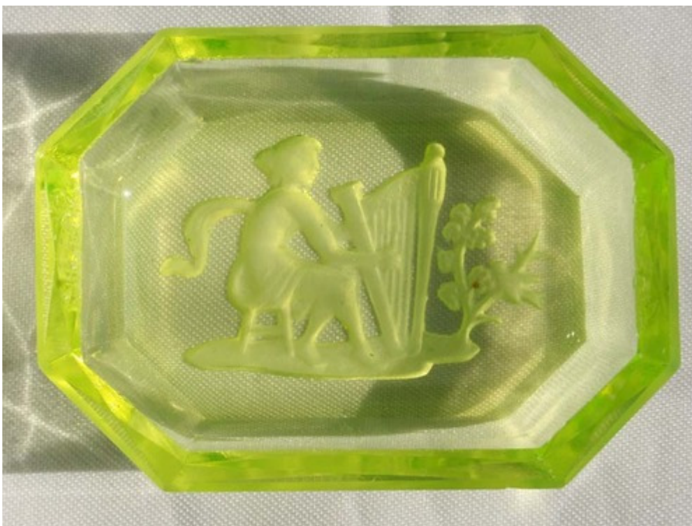
My "special" intaglio