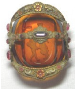
Enameled basket. Jewels on the sides.