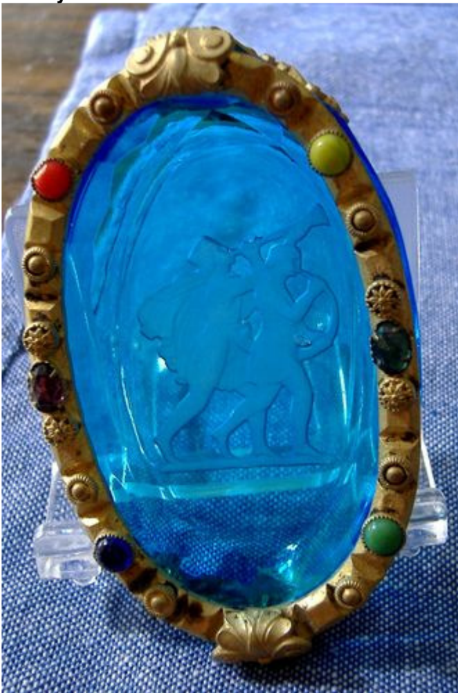
blue intaglio in frame