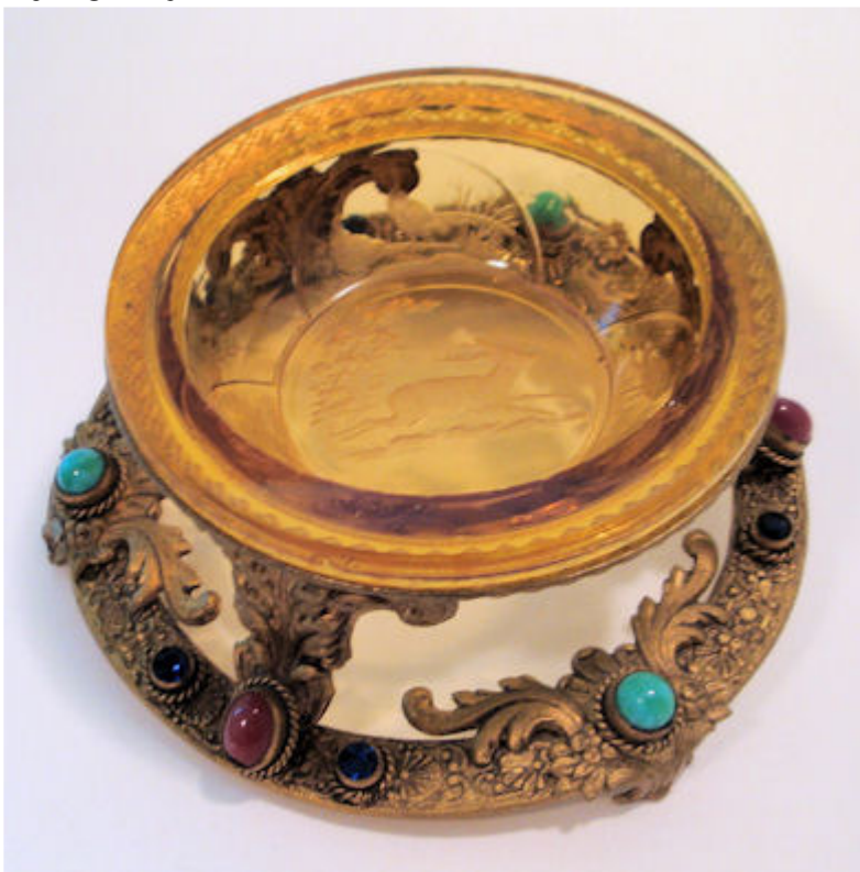
Unusal deeper salt.