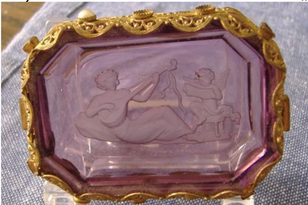
Amethyst intaglio in frame