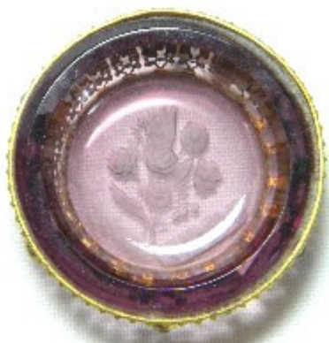
Tiny frame. Jewels around the sides.