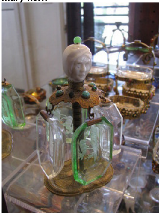
Once I saw this in the Smith books - I knew I had to have one !!!