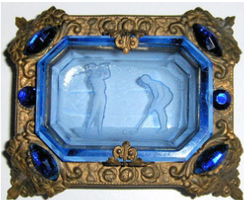
Blue golfer intaglio - not the original intaglio But I liked the holder.