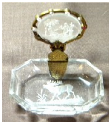
Salt/placecard holder combination. Jewels on the placecard holder.