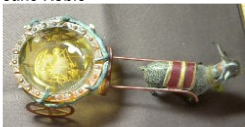
Metal goat cart frame. Actual twigs hold the salt in place.