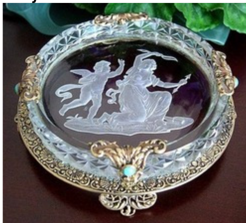
Another from my Clear Period...One of my favorites.