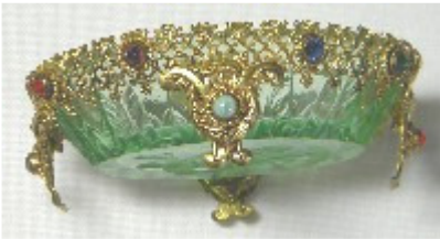
Side of frame.