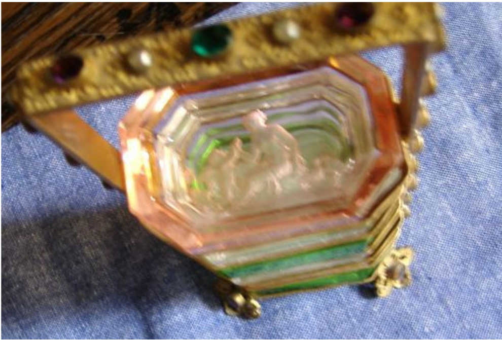
Top of intaglio tree