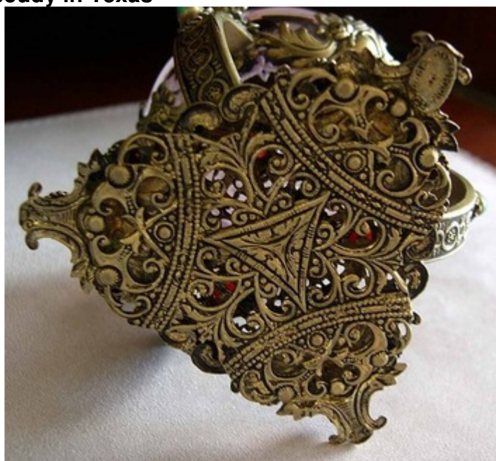
Bottom of salt below.