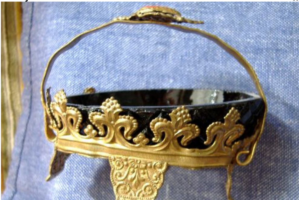
This is black glass, intaglio of moose can only be seen from bottom