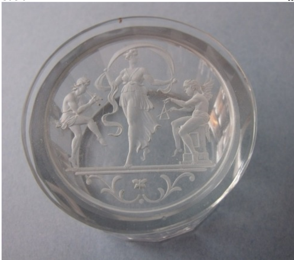
typical intaglio scene