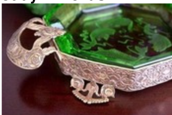
Detail of Frame on the Fish Intaglio