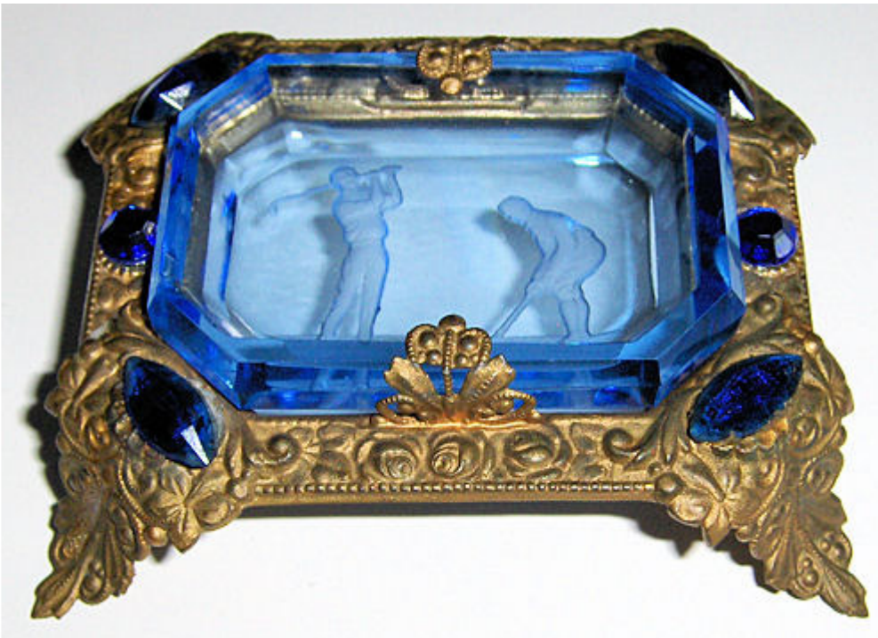
Another view - very graceful curve to the legs.