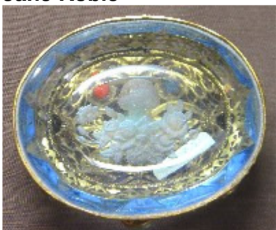
Top view of frame. Red spot is jewel.