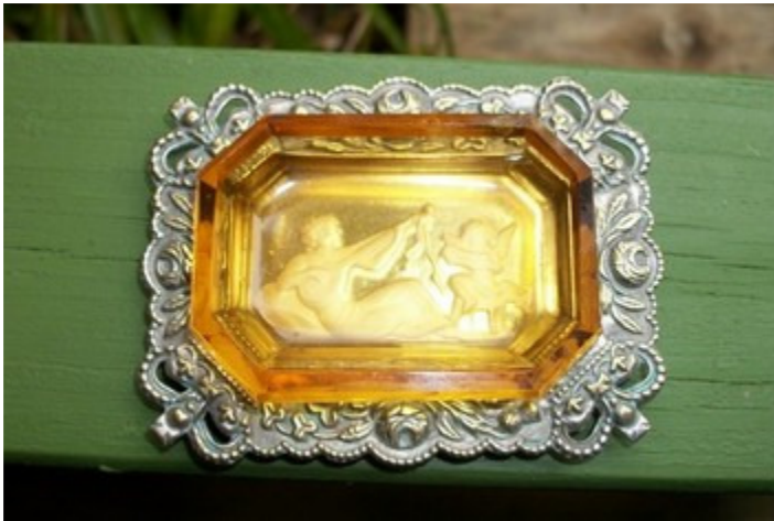
British Intaglio Holder