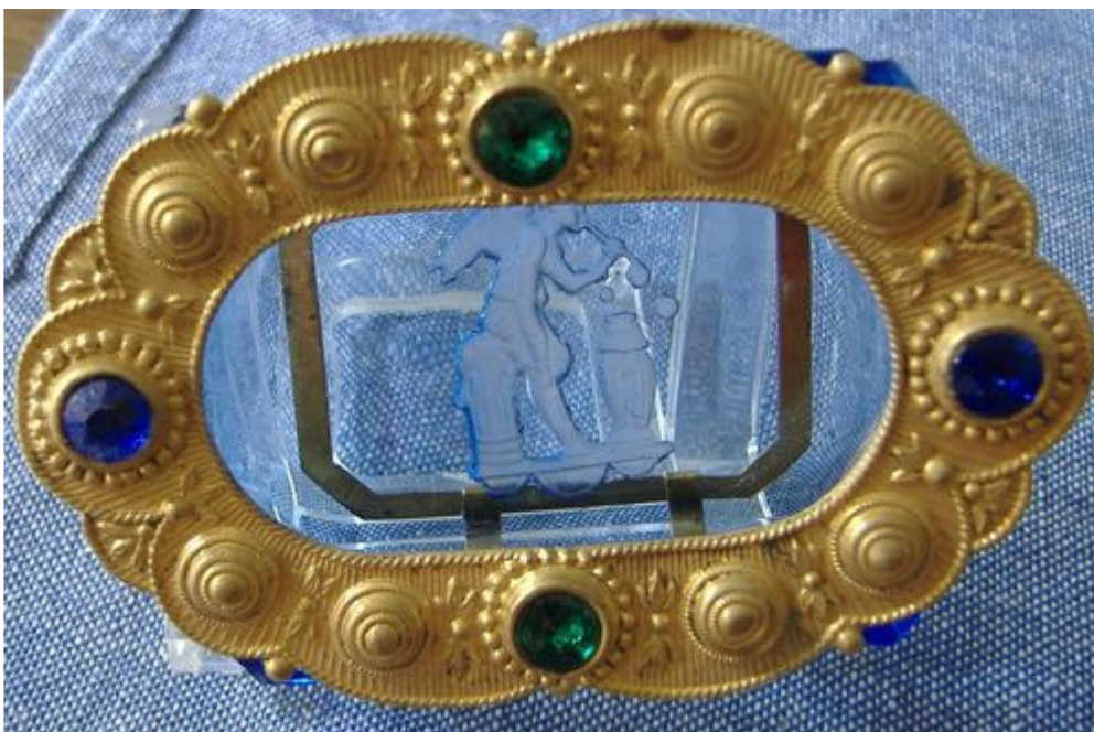
Intaglio in frame