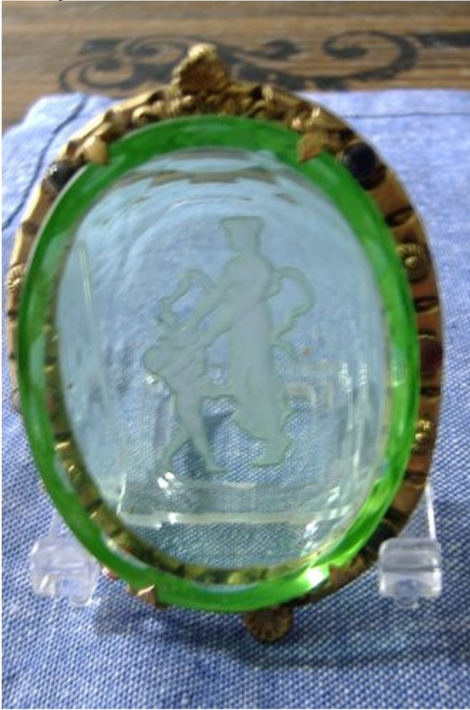
Green intaglio in frame