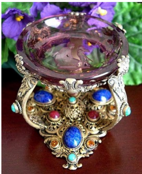
Another like Susie's salt.