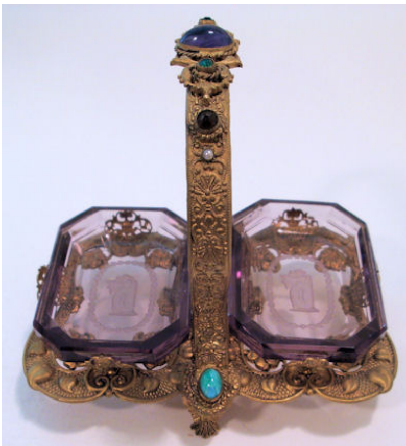
Nice Double in Amethyst