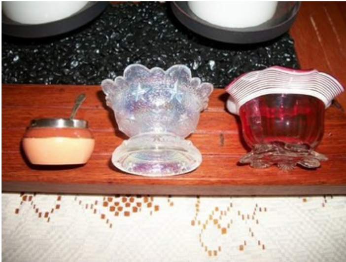
Small Striped salt 1891, Salt with Stars, Cranberry Threaded Salt