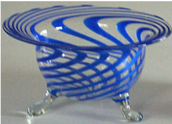
Blue stripes on clear - footed