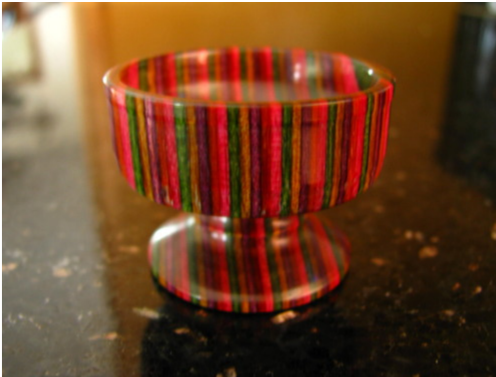
Stripes ~ Dymondwood