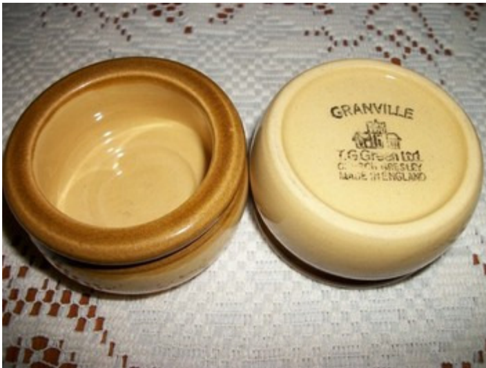
Granville Pattern T G Green Salt 2 1/4" across