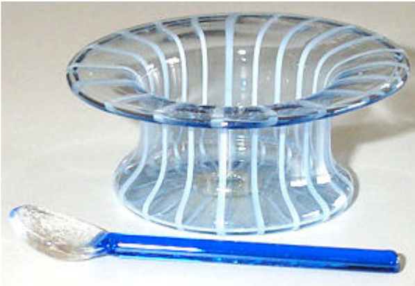
Teeny tiny Bimini with spoon