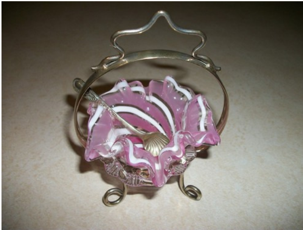
Striped Salt with Berry on base