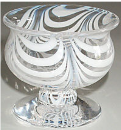
My OSC Award salt