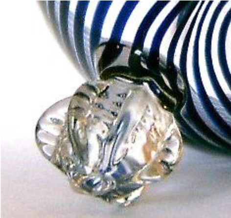
Close up of one of the feet on previous salt