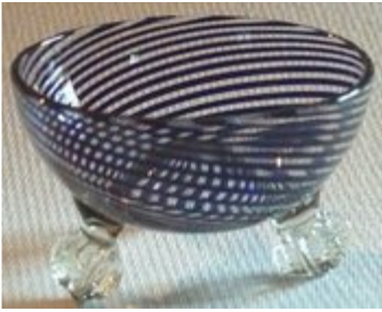
One of my favorites with fancy little feet