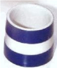
Newer Cornishware with newer T G Green mark