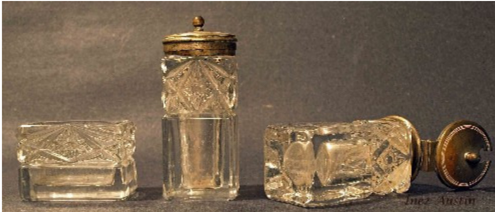
Star and crossed ribbed diamond condiment set