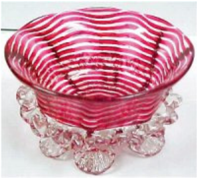
Cranberry stripes on clear