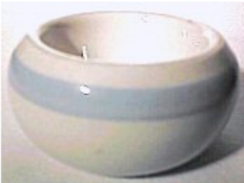
Pottery individual salt marked Grisley (England)