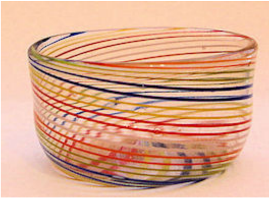
not quite red white and blue