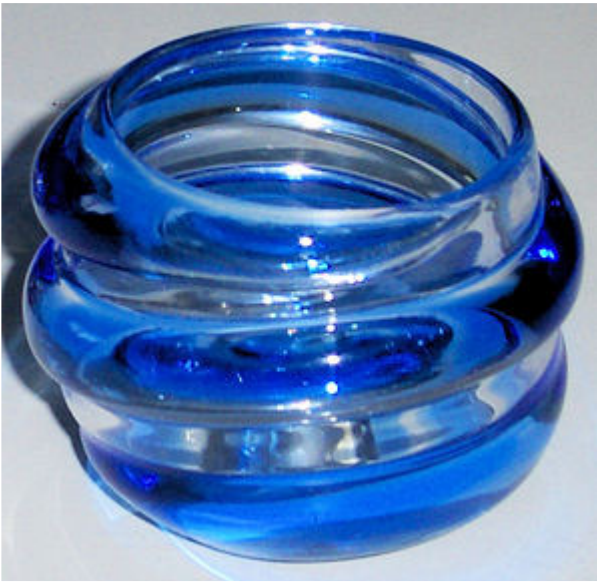
Wide blue spiral on clear glass