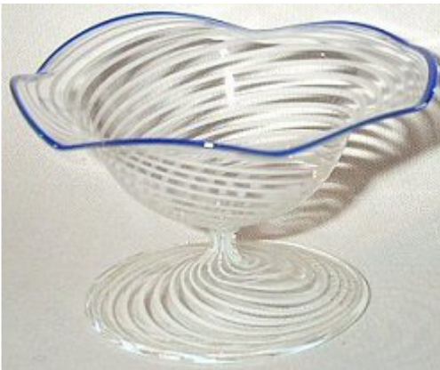
Bimini glass pedestal