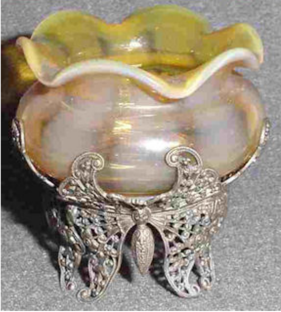
monet with striped