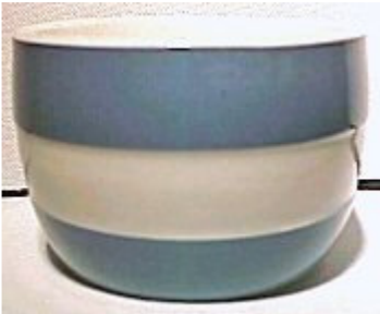
Cornishware with T G Green mark