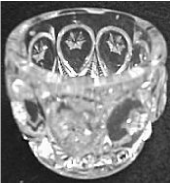
LOUISE pattern open salt with stars