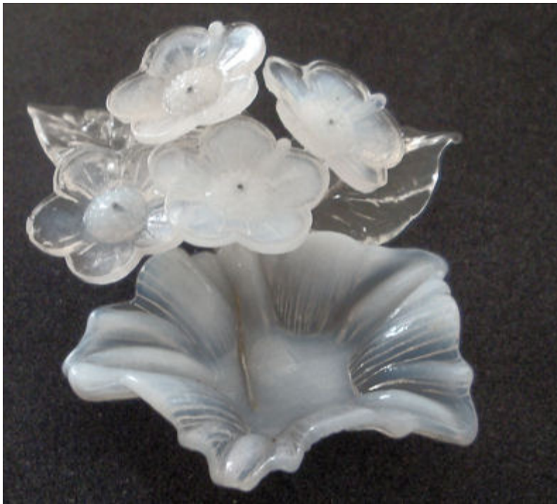
Hand made leaf salt pic 2