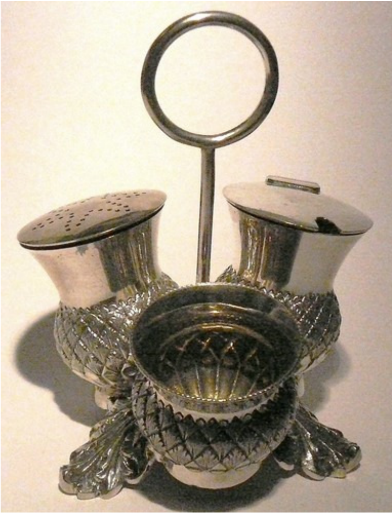
Thistles have leaves, no???