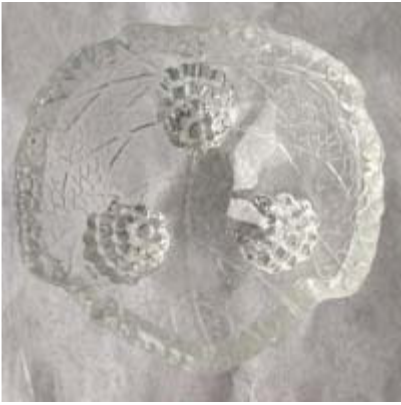
And one more grape leaf salt