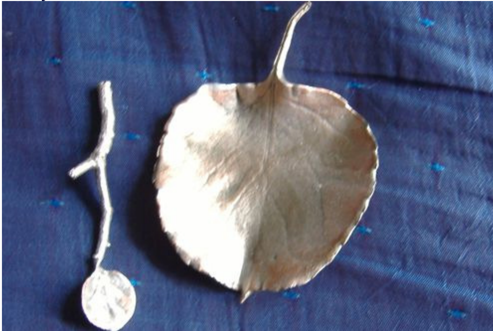
Aspen leaf salt and spoon