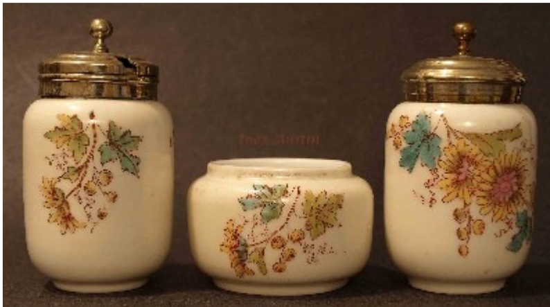
Leaf and mums, unmarked cruet set