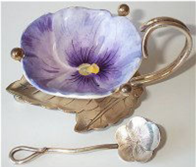
Pansy china on leaf base.