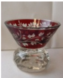
bohemian with leaves