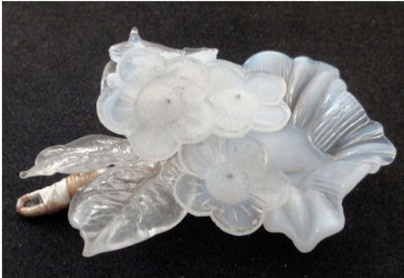
Hand made leaf salt pic 1