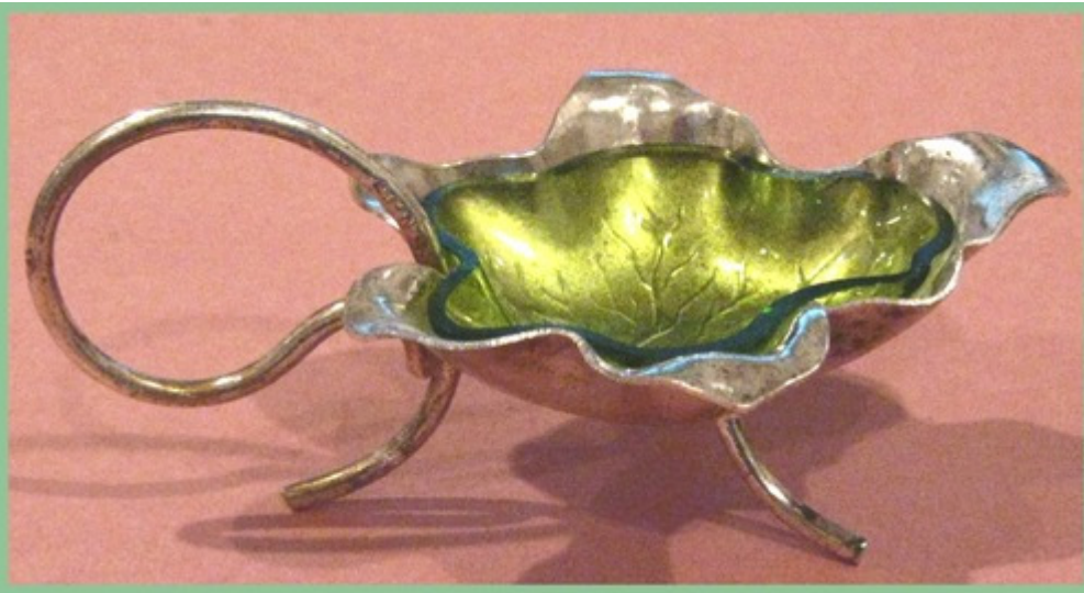
Silverplate leaf salt with matching green liner....