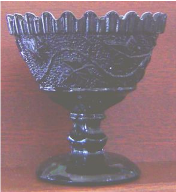
Black amethyst pedestal ivy leaf pattern