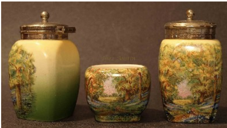
English Ware Lancasters LTD Hanley England c1930s EPNS