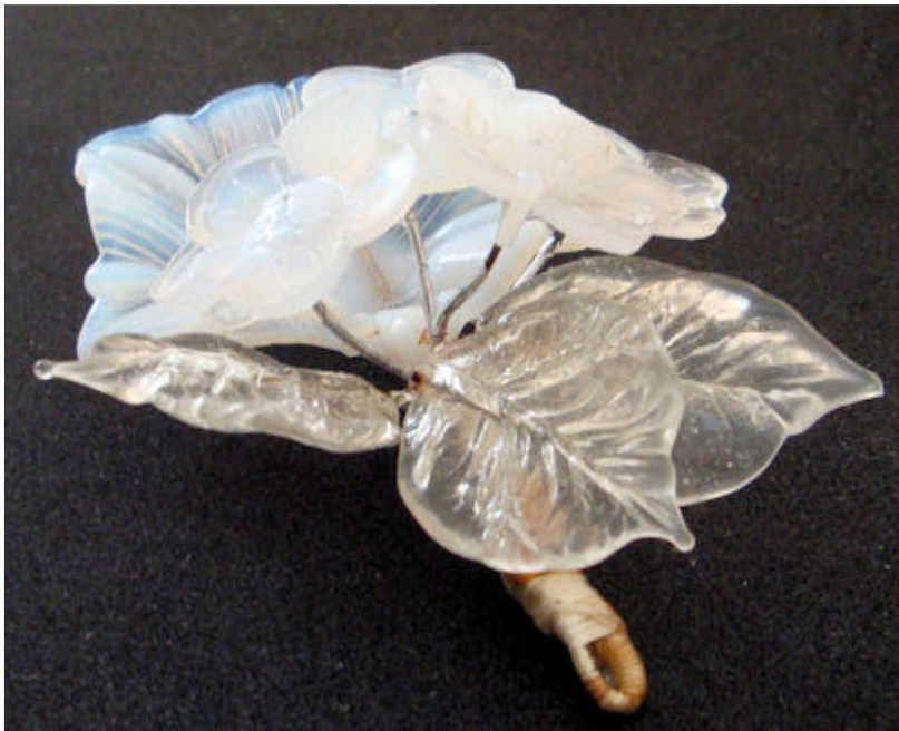
Hand made leaf salt pic 3