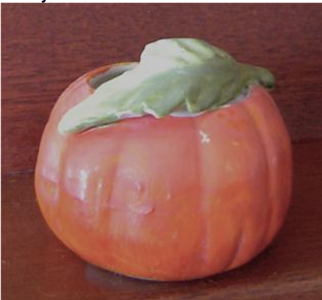
Unmarked Royal Bayreuth Pumpkin with leaf