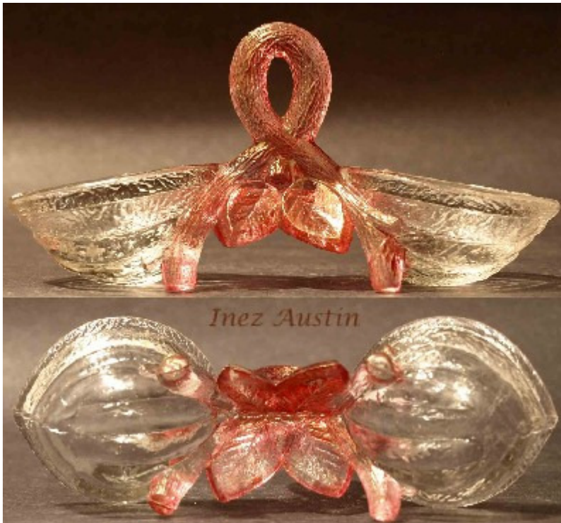
Possibly Vallerysthal #3286 in cranberry