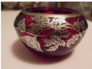
silver leaf overlay