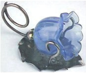
Light blue glass on leaf base.