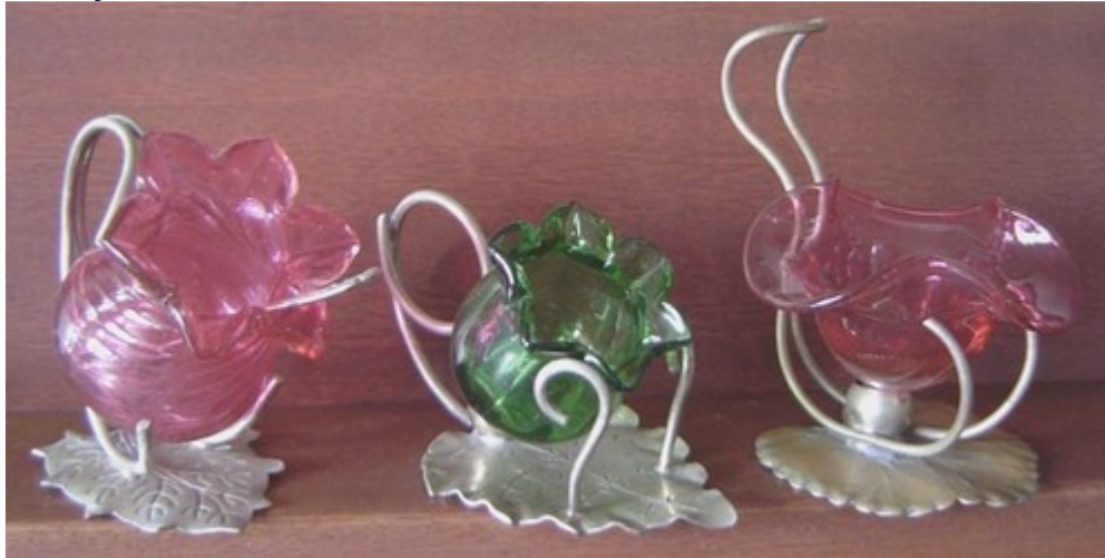
Blown flowers on leaf holders.