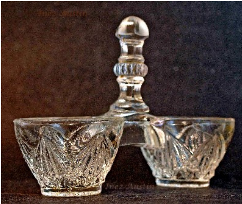
Brockwitz 1928 #8303