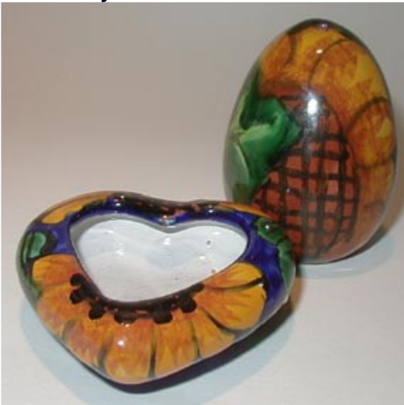
Do flowers count - From Mexico