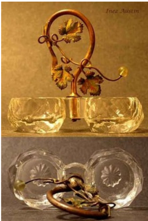
Vine on crystal double