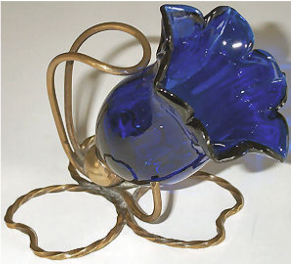
Cobalt flower shape with three-leaf clover base.