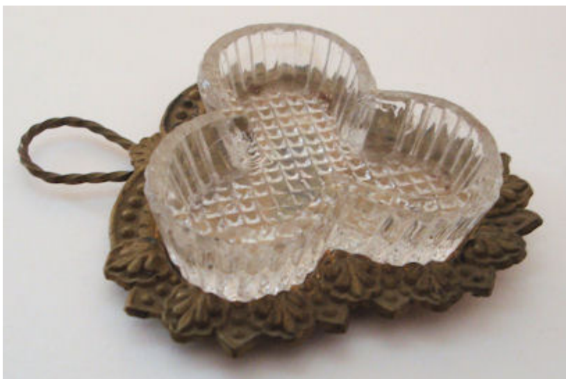
Leaf with three loop salt