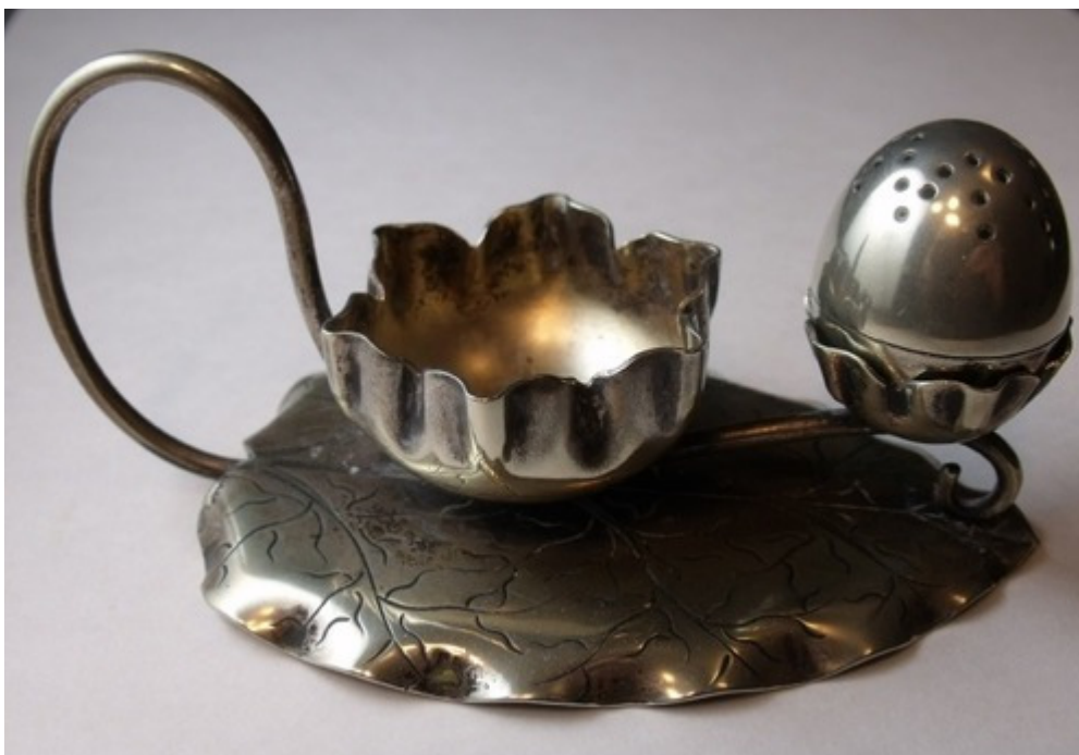
leaf open salt/pepper