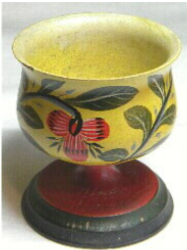
Lehnware Salt with Leaves