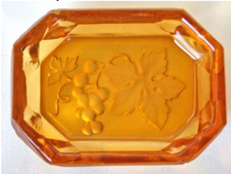
And an intaglio with the grape leaf -- one of my favorites.