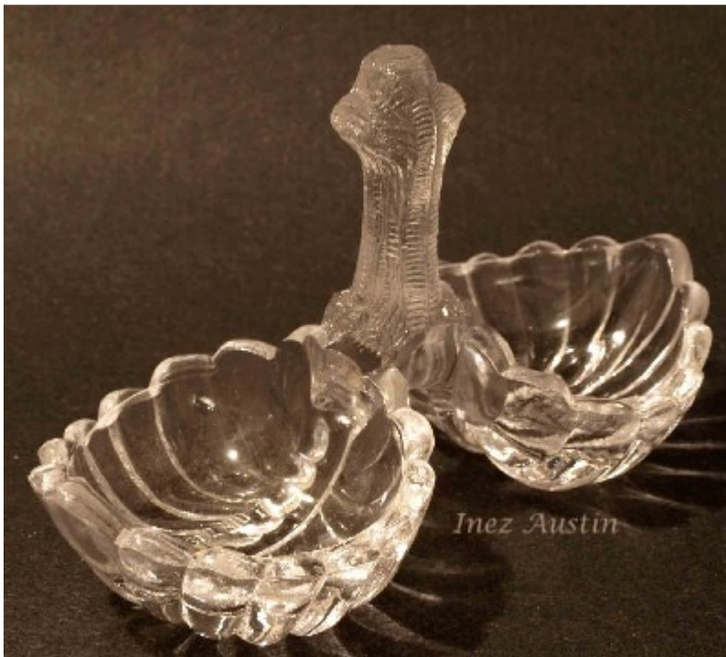
Portieux 3128 Nenuphar c1894