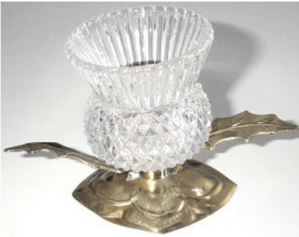
Clear glass Thistle on leaf base