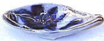
Another leaf shaped china salt