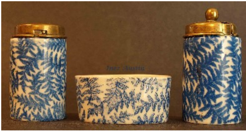
Fern Leaf cruet set, no identification.