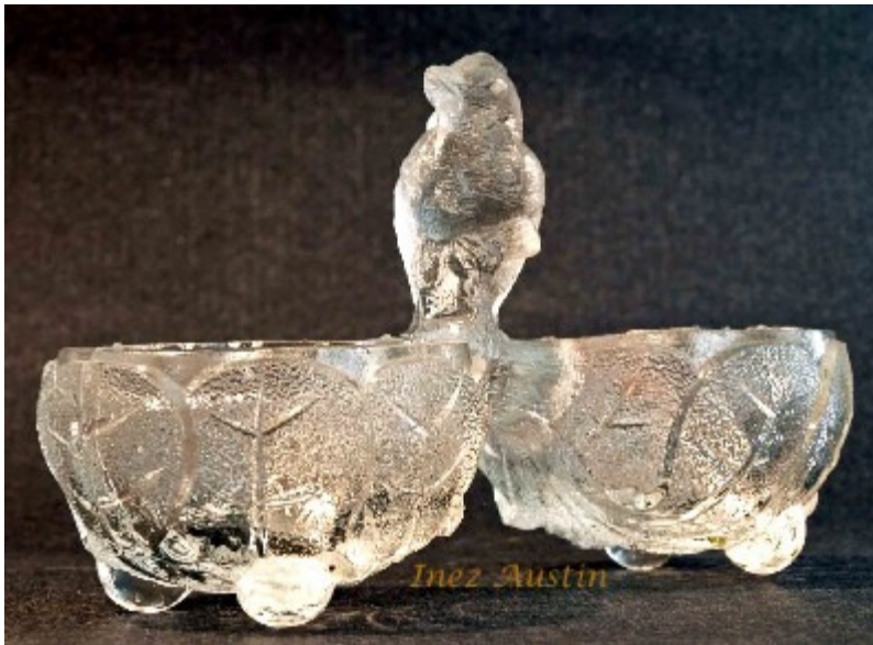
Vallerysthal-France, circa 1894