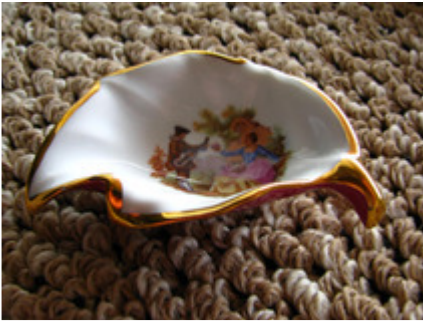
Porcelain leaf shape with courting couple :)