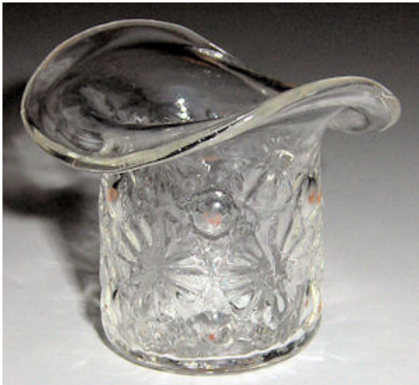
Old blown glass hat