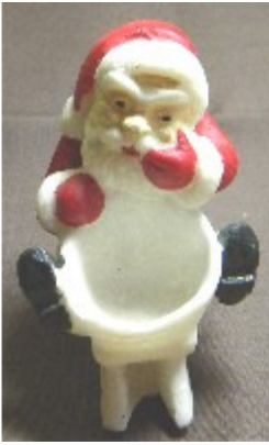
Santa - wearing his boots and hat!