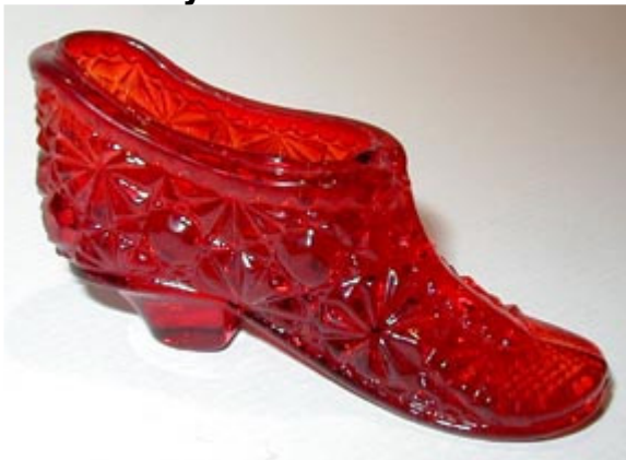
Another 2" shoe