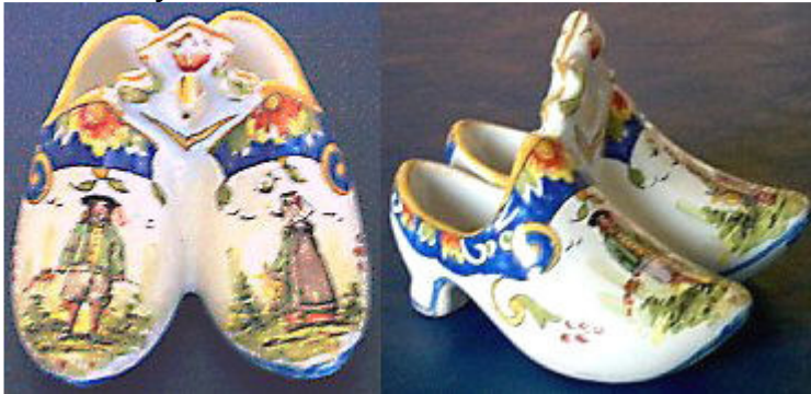
My faience shoes...old picture