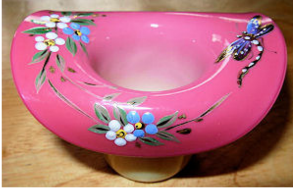
Signed Pairpoint 1993 and 2/80.