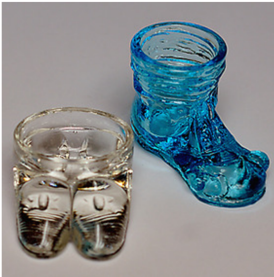
Pilgrim style slipper