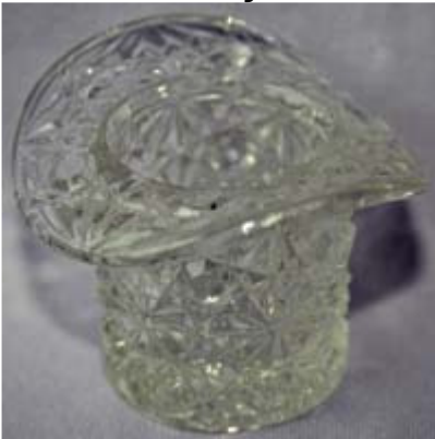
Clear hat 1