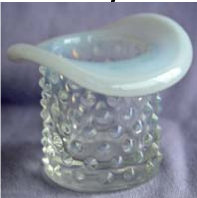
Clear hat 2