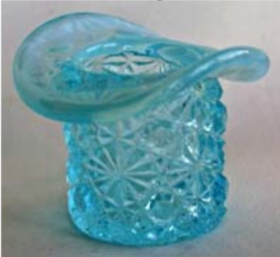
Blue hat 3