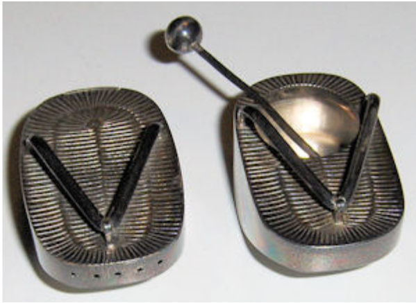
My Oriental shoes