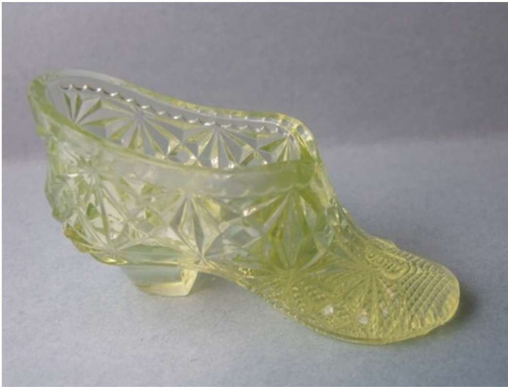
little yellow shoe