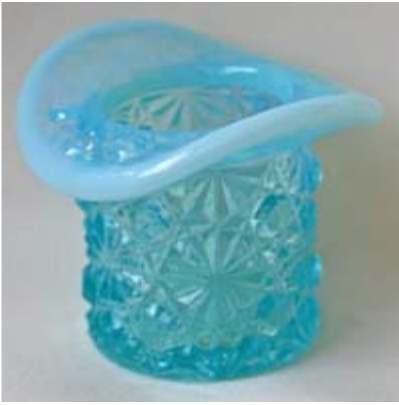
Blue hat 2