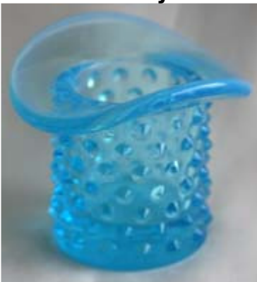
Blue hat 1