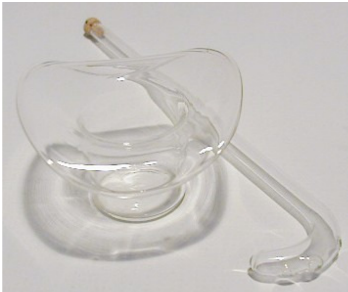
Top Hat & Cane - Ready to celebrate the Holidays !!!