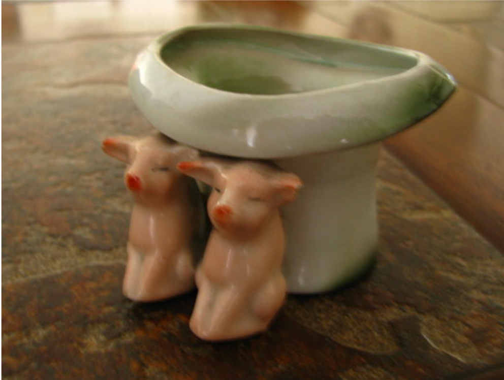
My favorite - Top hat with piggies!!! :)