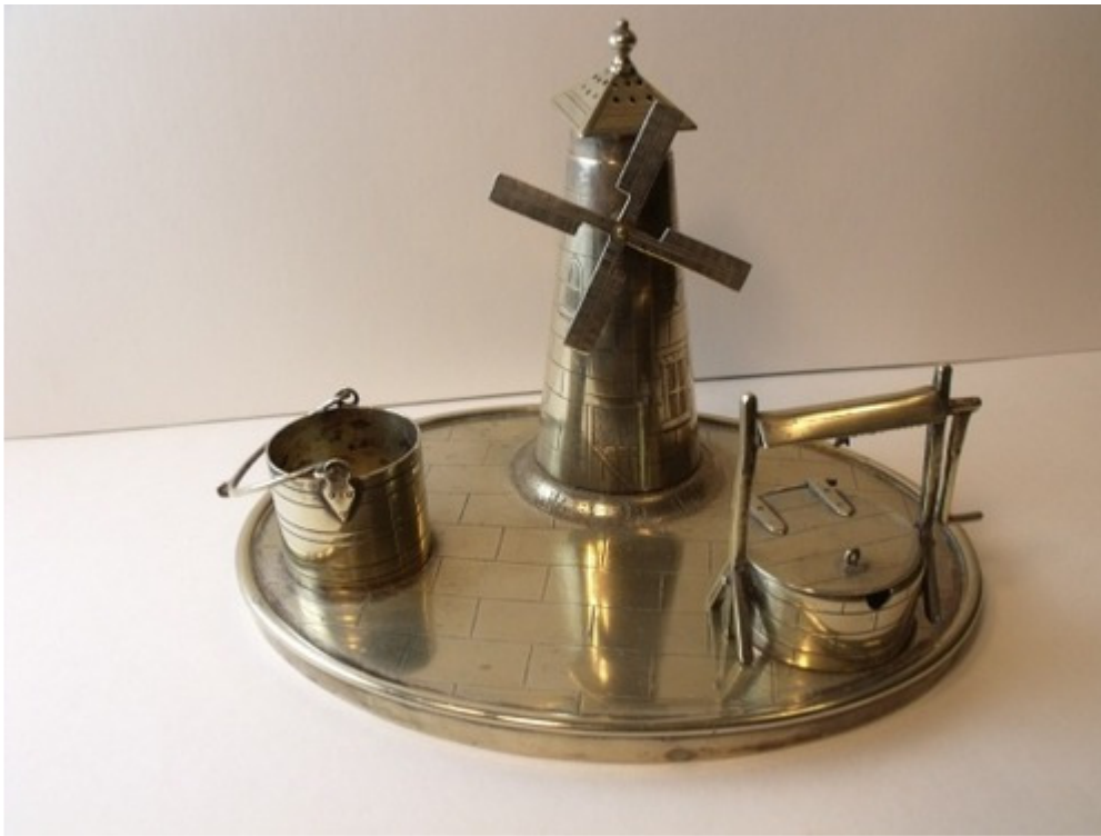
my first condiment set :)