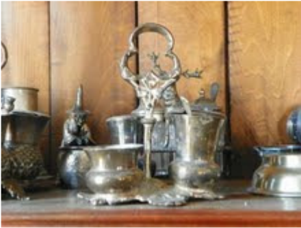
Yet another variety of the thistle condiment