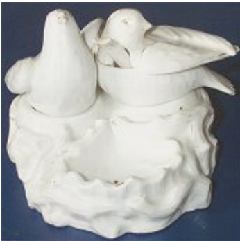
Plain white birds