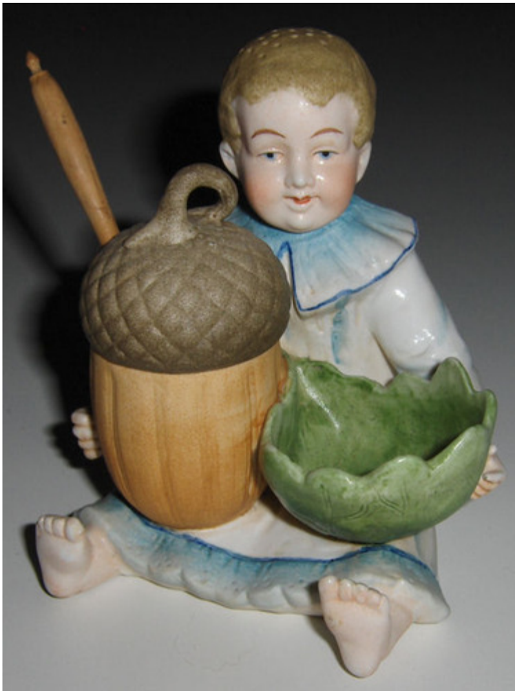
Toddler with an acorn and leaf. The head comes off and is the shaker.