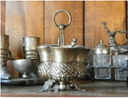
Another different thistle set...