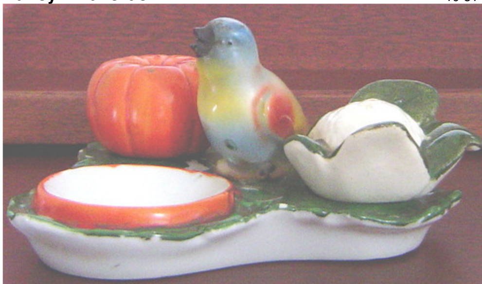
Bird and Vegetable condiment set