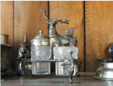
Deer, cut glass inserts, griffon legs