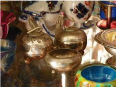
My curling set - a little different than PJ's.