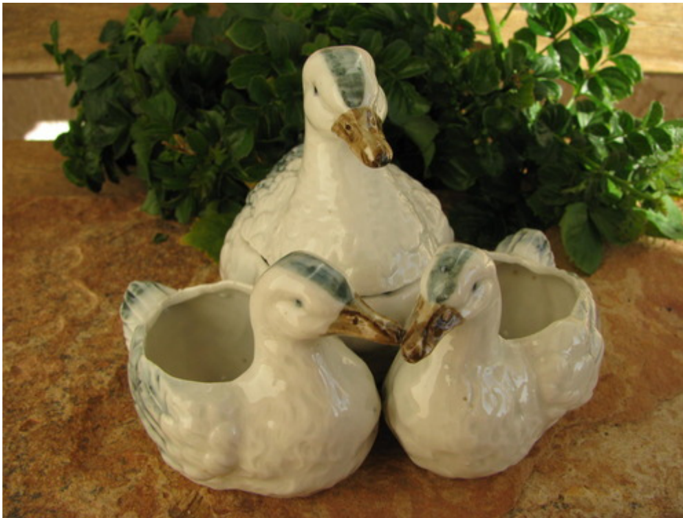
Mother duck mustard & baby duck salts :)