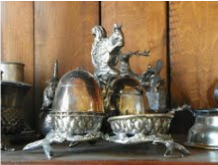
Squirrel with nuts - Debi helped me get a second matching spoon!