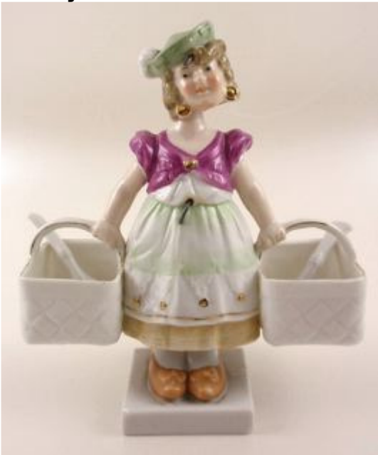
Bobble Head or Nodder condiment