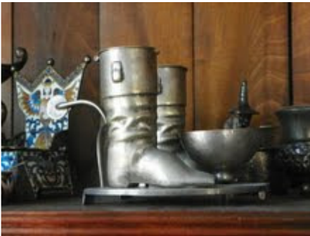
Jockey cap, boots, spur handle