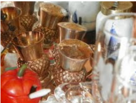
A different thistle set