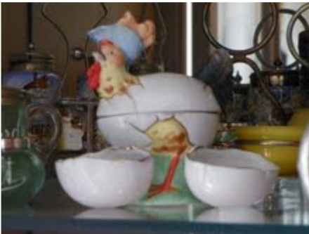
Momma chicken wearing hat