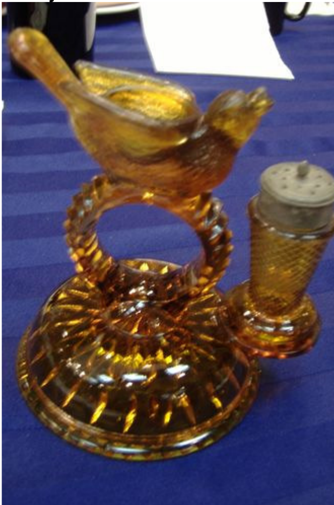
Amber breakfast set