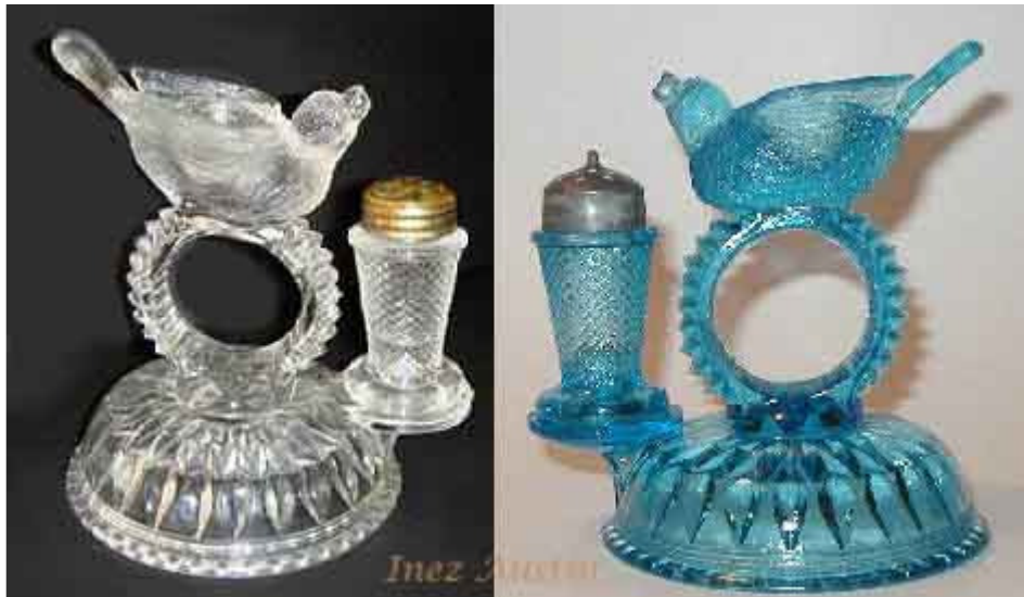
Aetna Glass c1887 4-38 inch diameter pedestal x 5-14 tall x 2-38-diameter ring