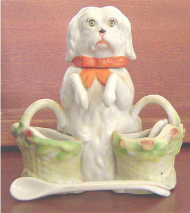
Begging doggie condiment set