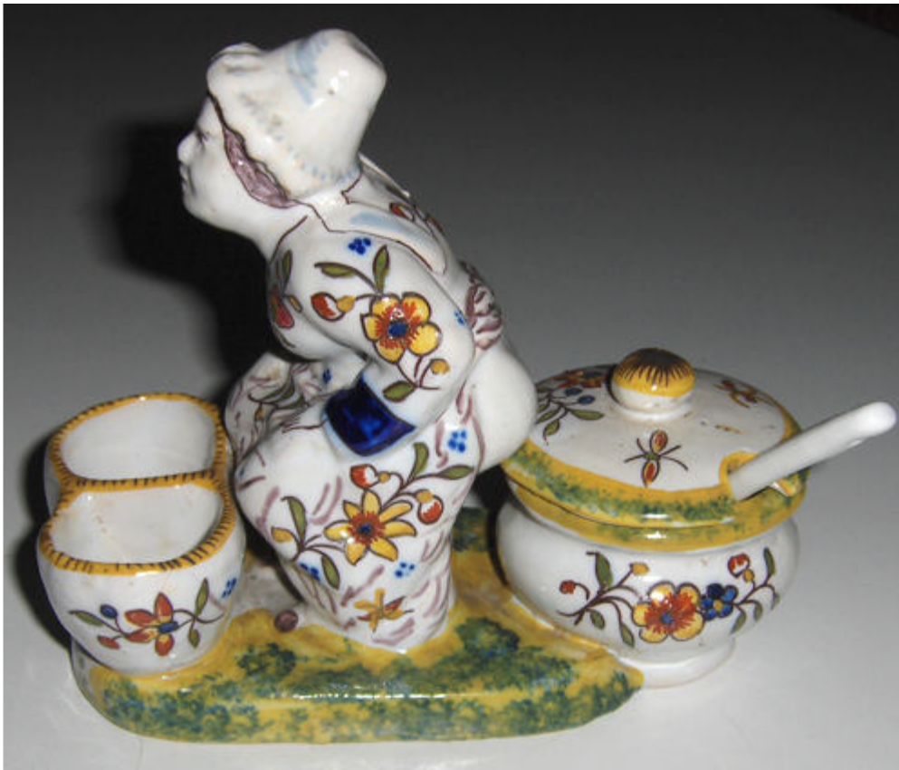
And the "Butt Lady."