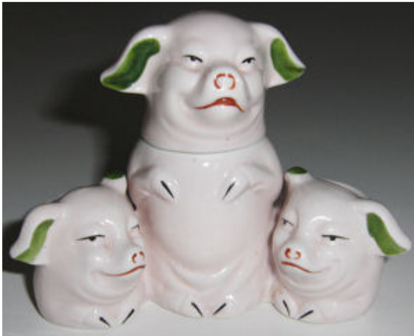
Oui Oui Oui - Is that what the French piggies say?