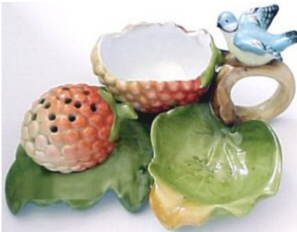
My bird has a berry