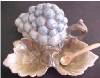
Bunch of grapes and leaves