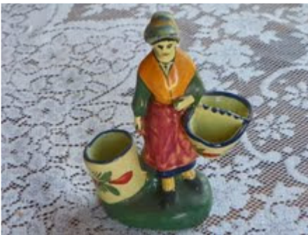
Here's an ugly lady to go with your ugly men!