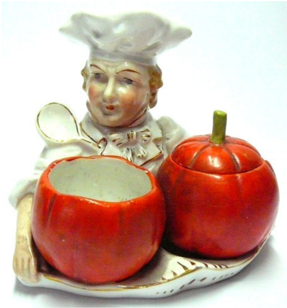
My little French Chef