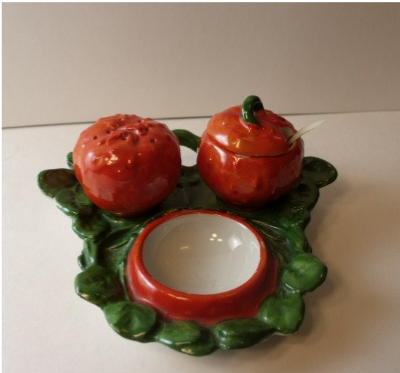
Made in Germany