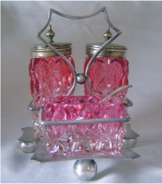
Cranberry to clear set. Salt similar to individual below.