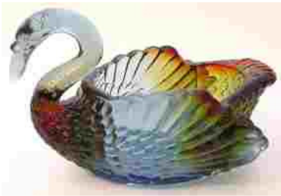
BOYD CAMBRIDGE SWAN