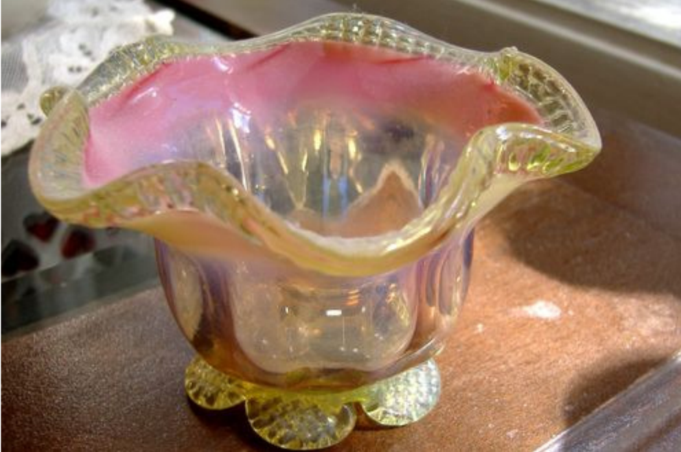
Pink and green salt