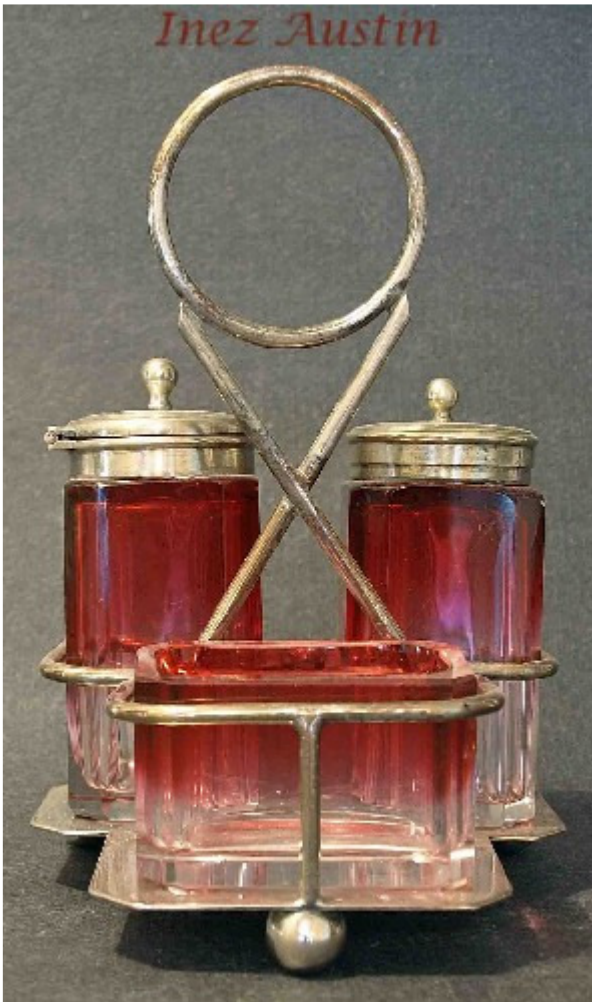
cranberry to clear rectangular cruet set