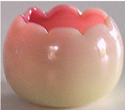
Not sure if this is truly a salt, but I love the form and coloring.