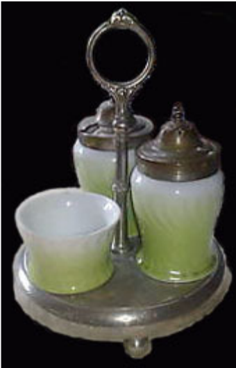
Mauser Shutz c1910