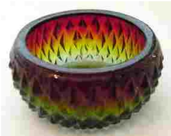
BOYD MOUNT VERNON