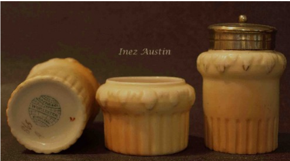
Locke and Co - Worcester England 865 A