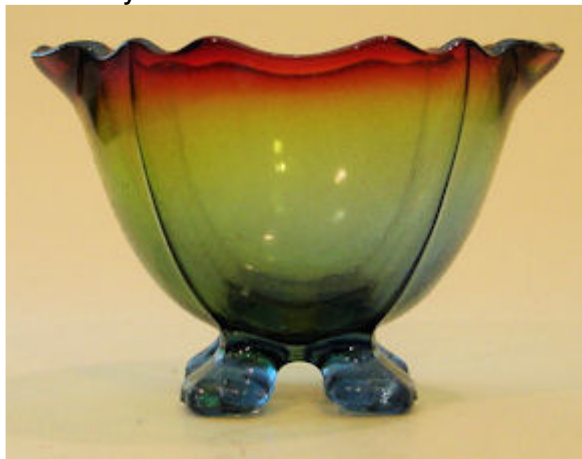
Summit 4 TOED