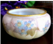
Mt Washington Burmese Master Salt