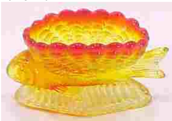
FIGURAL FISH L.G. WRIGHT