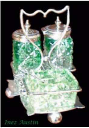
Inez Austin green fading to clear glass cruet set