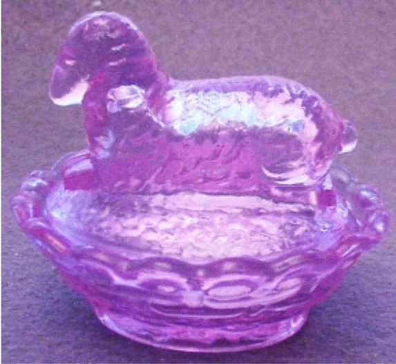
BOYD COVERED LAMB SALT