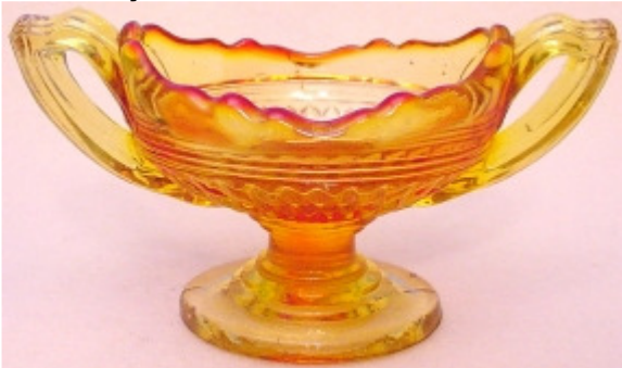
SUMMIT CAMBRIDGE 2 HDL MT VERNON PEDESTAL