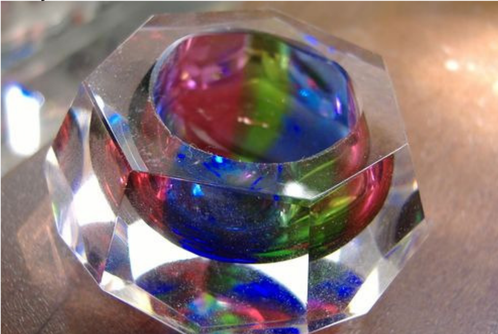
Many colored salt