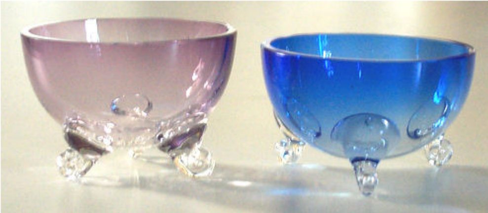
Amethyst to clear and blue to clear