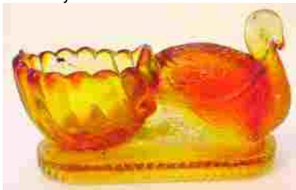
ST CLAIR SWAN & SHELL, MARKED J. ST C. RARE.