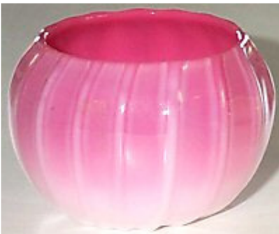
Pairpoint salt or individual sugar