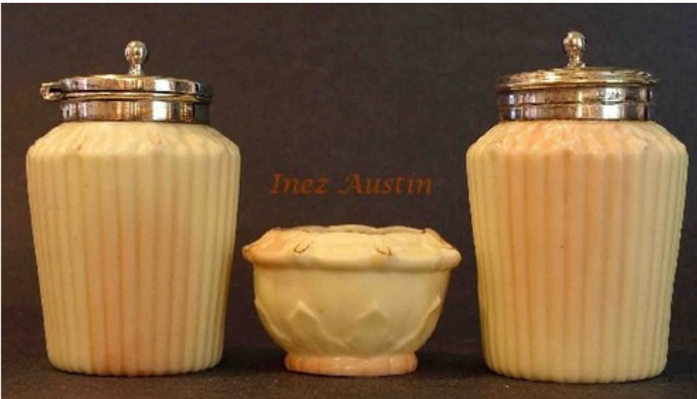
Locke and Co. Worcester England 659 os and 680 PM