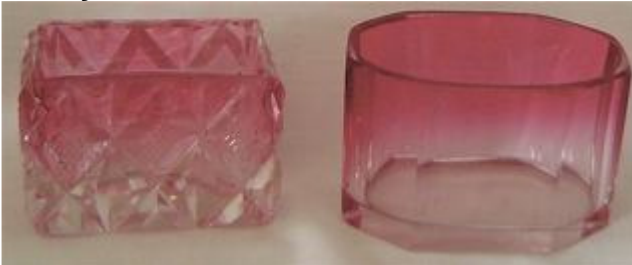
Cranberry to clear salts intended for sets. Moved from cut-to-clear.