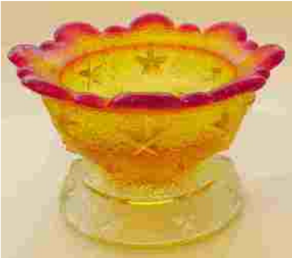
WRIGHT STIPPLED STAR