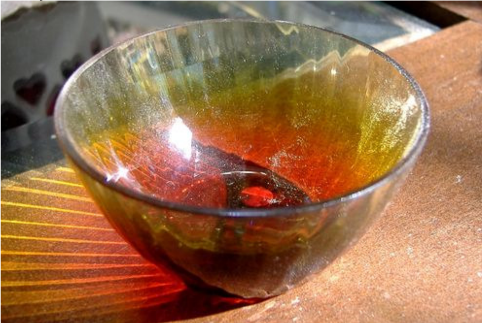
small round Rubina? Amberina? salt The difference always confuses me.