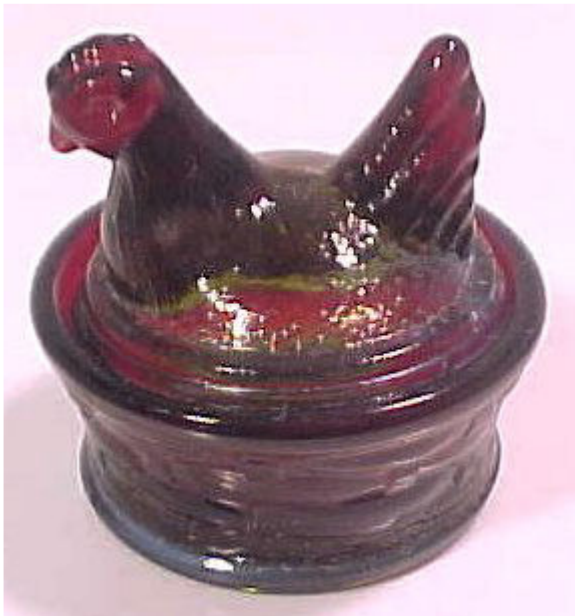
EE MINI HEN COVERED SALT