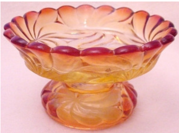
SIGNED "BACCARAT" "DEPOSE"