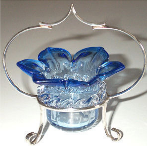
Blurina glass salt in holder