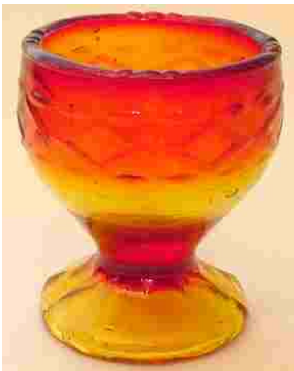
TECHNIGLASS ROUND PEDESTAL SALT