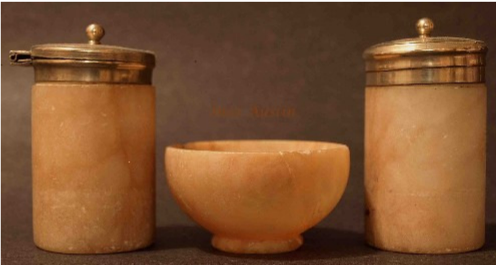
Marble cruet set