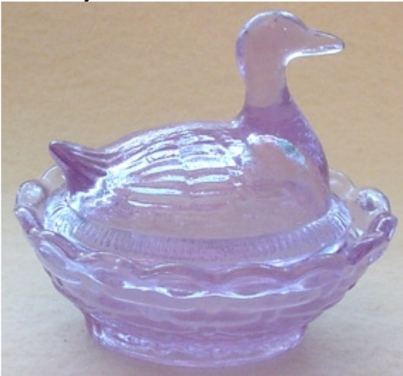
BOYD COVERED DUCK SALT