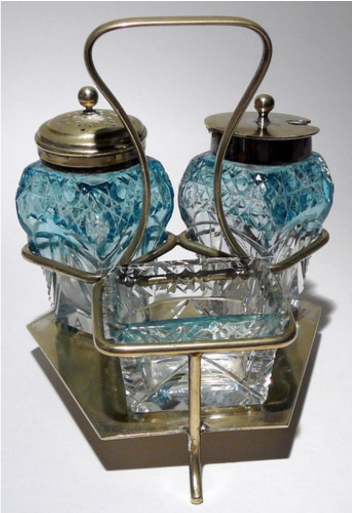
PJ's bluina glass condiment set.